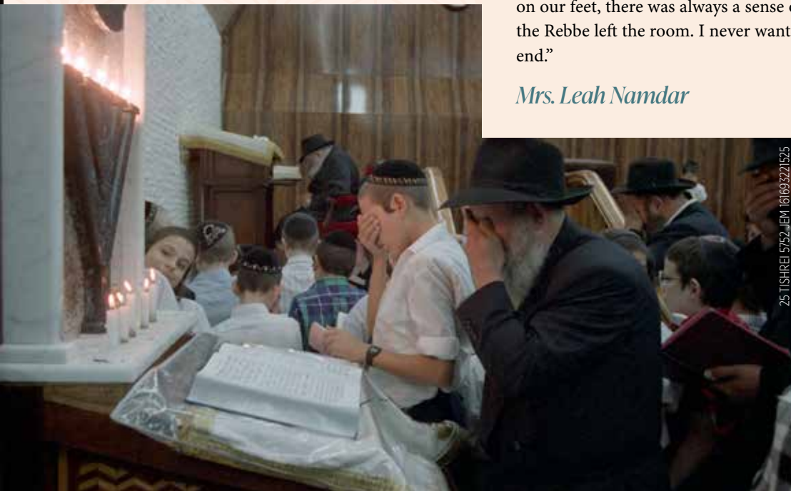
25 TISHREI 5752 JEM 161693271525