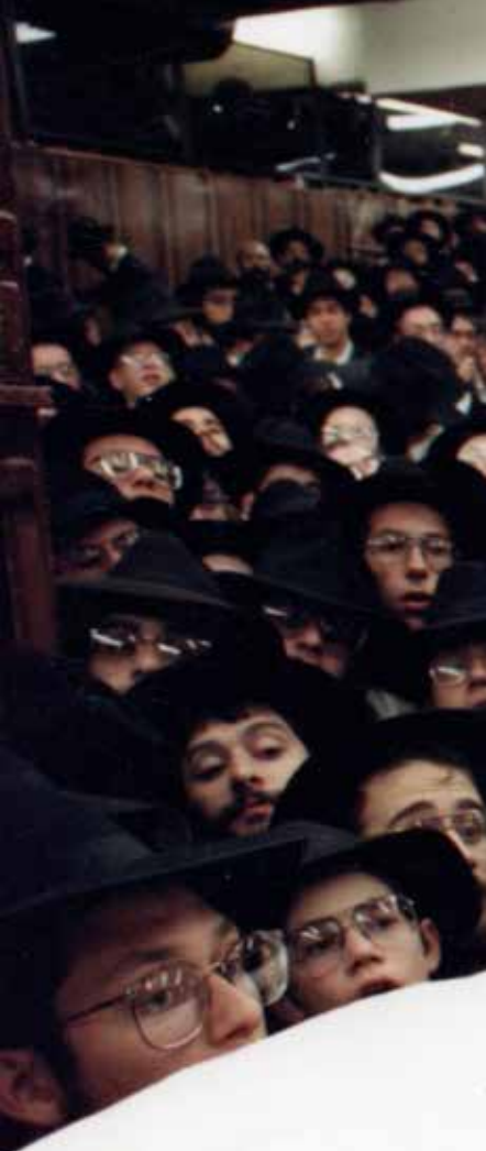
ILLUSTRATION PHOTO - 2 TISHREI 5752