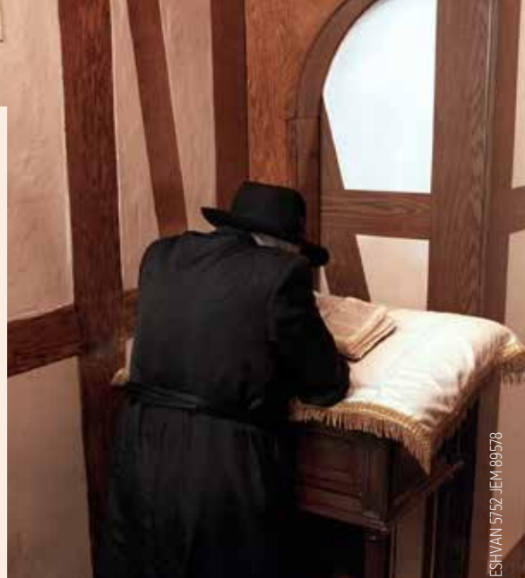
26 CHESHVAN 5752 JEM 89578