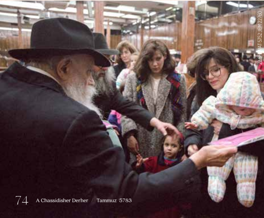
22 SHEVAT 5752 JEM 22760