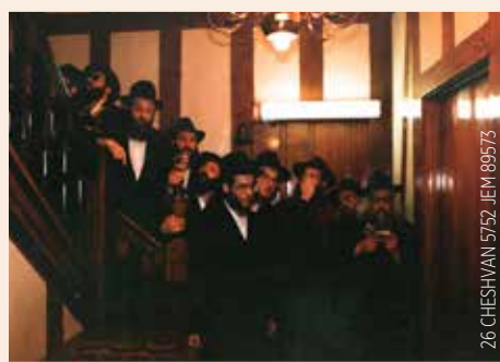
26 CHESHVAN 5752 JEM 89573