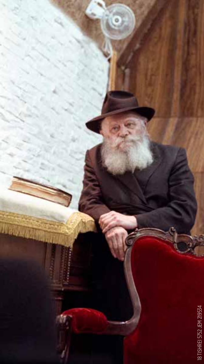
18 TISHREI 5752 JEM 219554