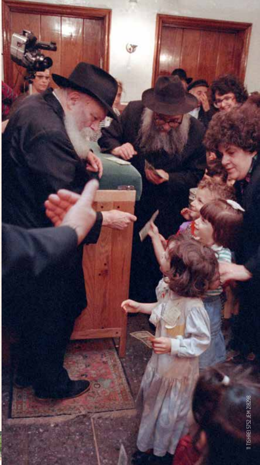
11 TISHREI 5752

With each dollar, to each person the Rebbe would wish a " Bracha V'hatzlacha ," then some would ask for a specific bracha or advice. At times, I was fortunate to be behind someone who spoke to the Rebbe, and I watched from up close as the Rebbe conversed with them.