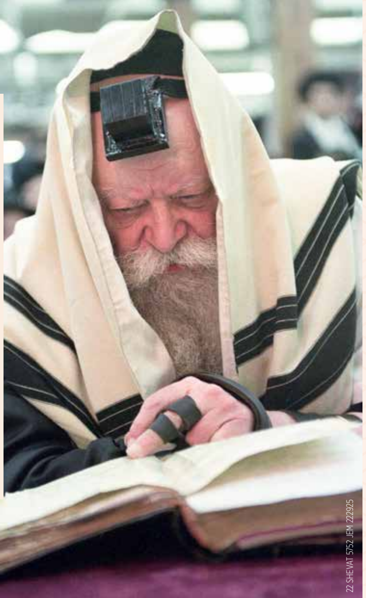
22 SHEVAT 5752 JEM 222925