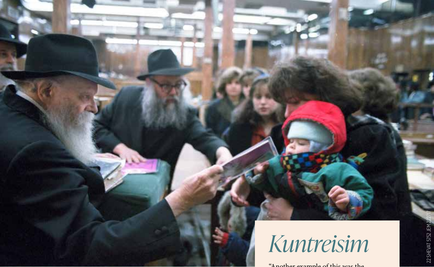
22 SHEVAT 5752 JEM 22777