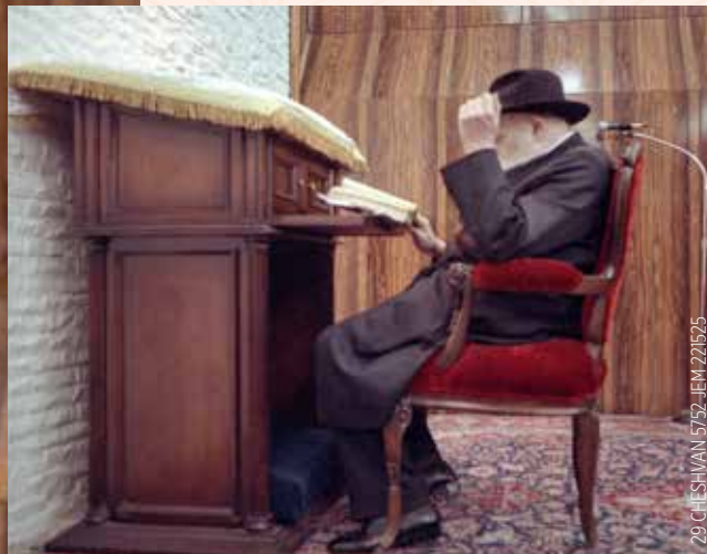
29 CHESHVAN 5752 JEM 221525