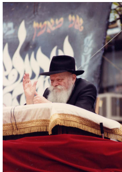
THE REBBE WATCHES THE PROCESSION OF THE LAG B'OMER PARADE, 5750

As mentioned, the Rebbe made a great deal of the fact that so many Jewish girls have been named “Chaya Mushka” for the Rebbetzin. Pictured here is a group of small girls all bearing the name “Chaya Mushka” parading by the Rebbe on Lag B’Omer, 5750, two years after Chof Beis Shevat.