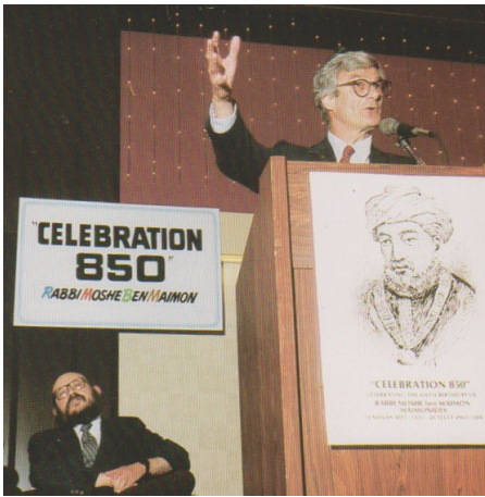
SENATOR BOSCHWITZ ADDRESSES THE SIYUM HARAMBAM IN MINNESOTA. THE REBBE THANKED HIM FOR HIS PARTICIPATION AT THIS CHOF-AV FARBRENGEN. (SEE PG. 23)