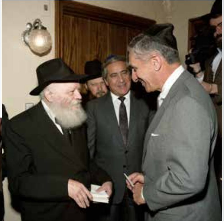
4 TISHREI 5747

On 4 Tishrei 5746*, the members of the newly established MIDF came to 770 for a planned program. Part of the event was to attend the Rebbe's minyán for krias haTorah .