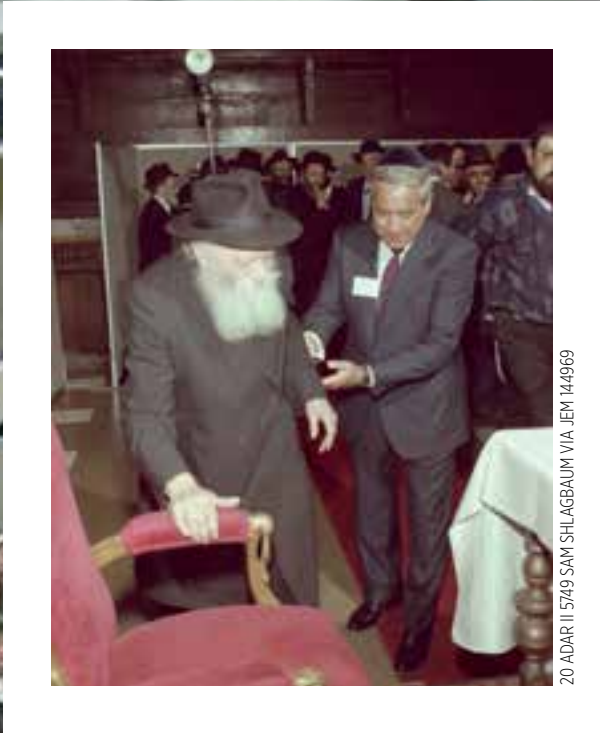
20 ADAR II 5749 SAM SHLAGBAUM VIA JEM 144969