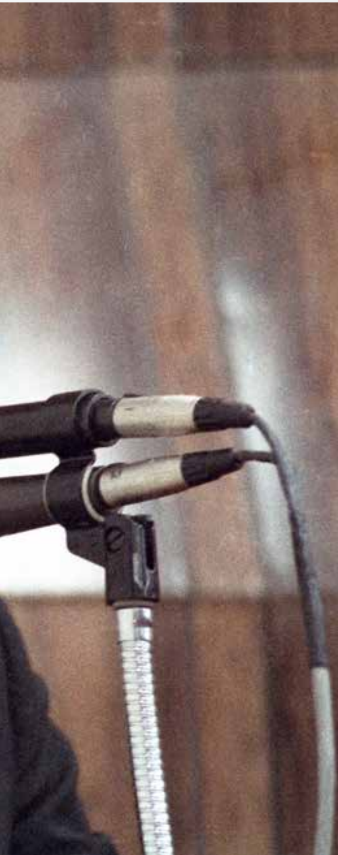
3 TISHREI 5746

In earlier years the Rebbe would inform the mesadrim if there would be a sicha and a microphone would be brought to the Rebbe's shtender .