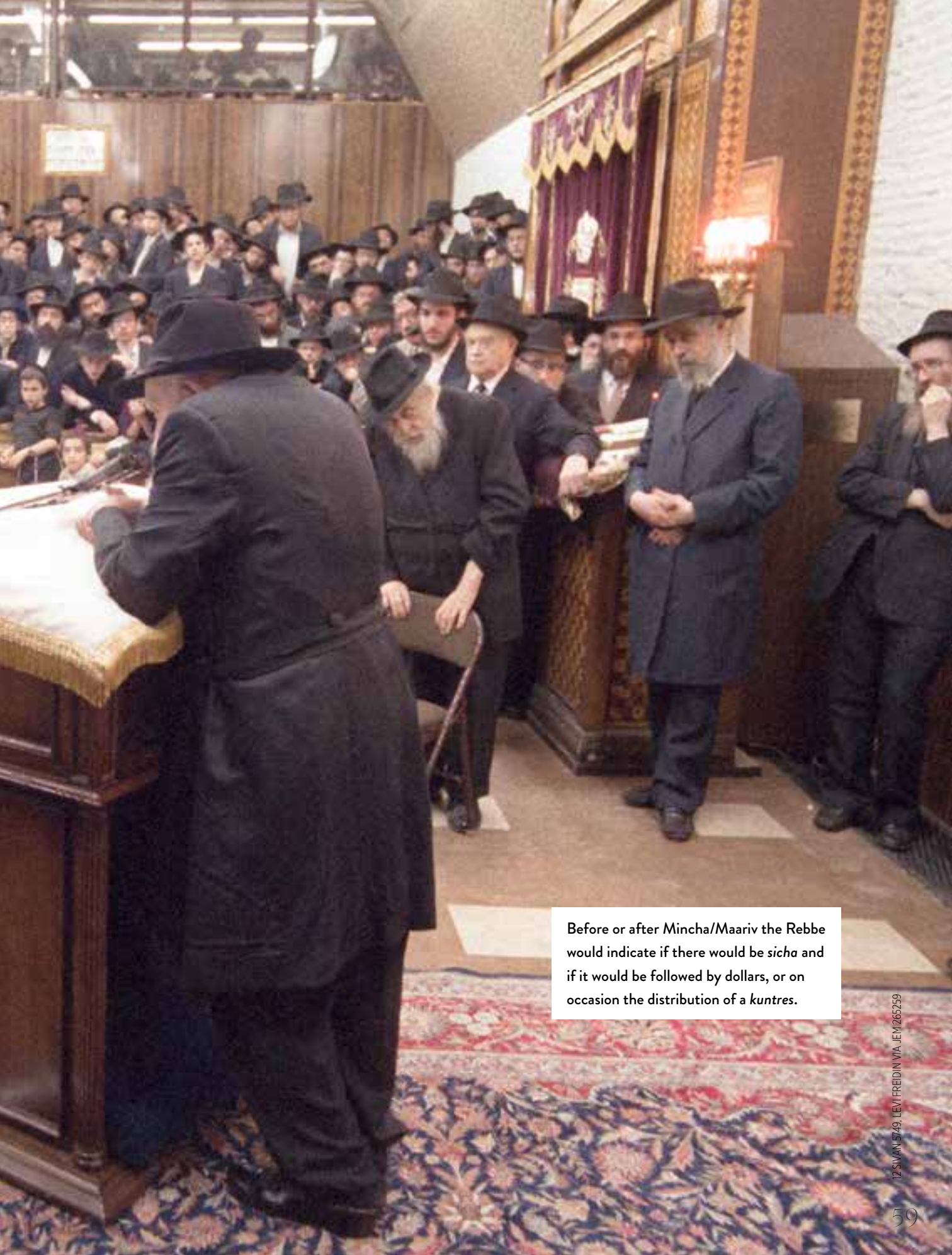
Before or after Mincha/Maariv the Rebbe would indicate if there would be sicha and if it would be followed by dollars, or on occasion the distribution of a kuntres .