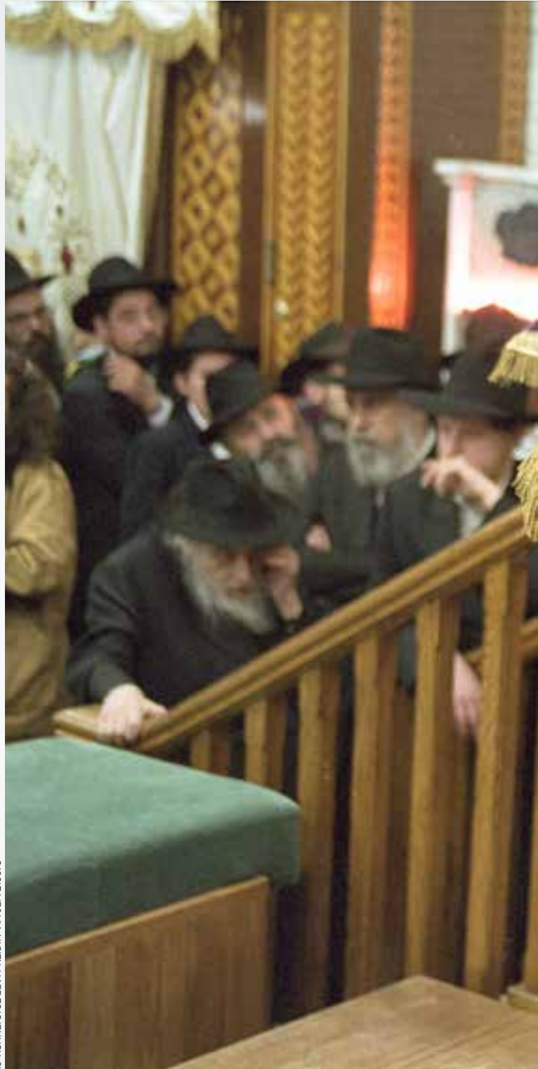
18 TISHREI 5752

The Rebbe would often start off with a bracha , and continue to talk about the significance of the time and the week's parsha , speaking strongly about how it all connects to Moshiach and how the world and everything in it stands ready to bring the geulah . May we indeed be zocheh תיכף ומיד to hear these sichos once more with the Rebbe, תורה חדשה מאתי תצא.