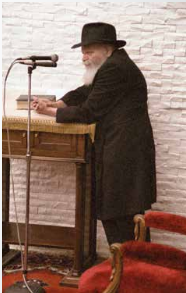
8 TISHREI 5746

In earlier years the Rebbe would inform the mesadrim if there would be a sicha and a microphone would be brought to the Rebbe's shtender .