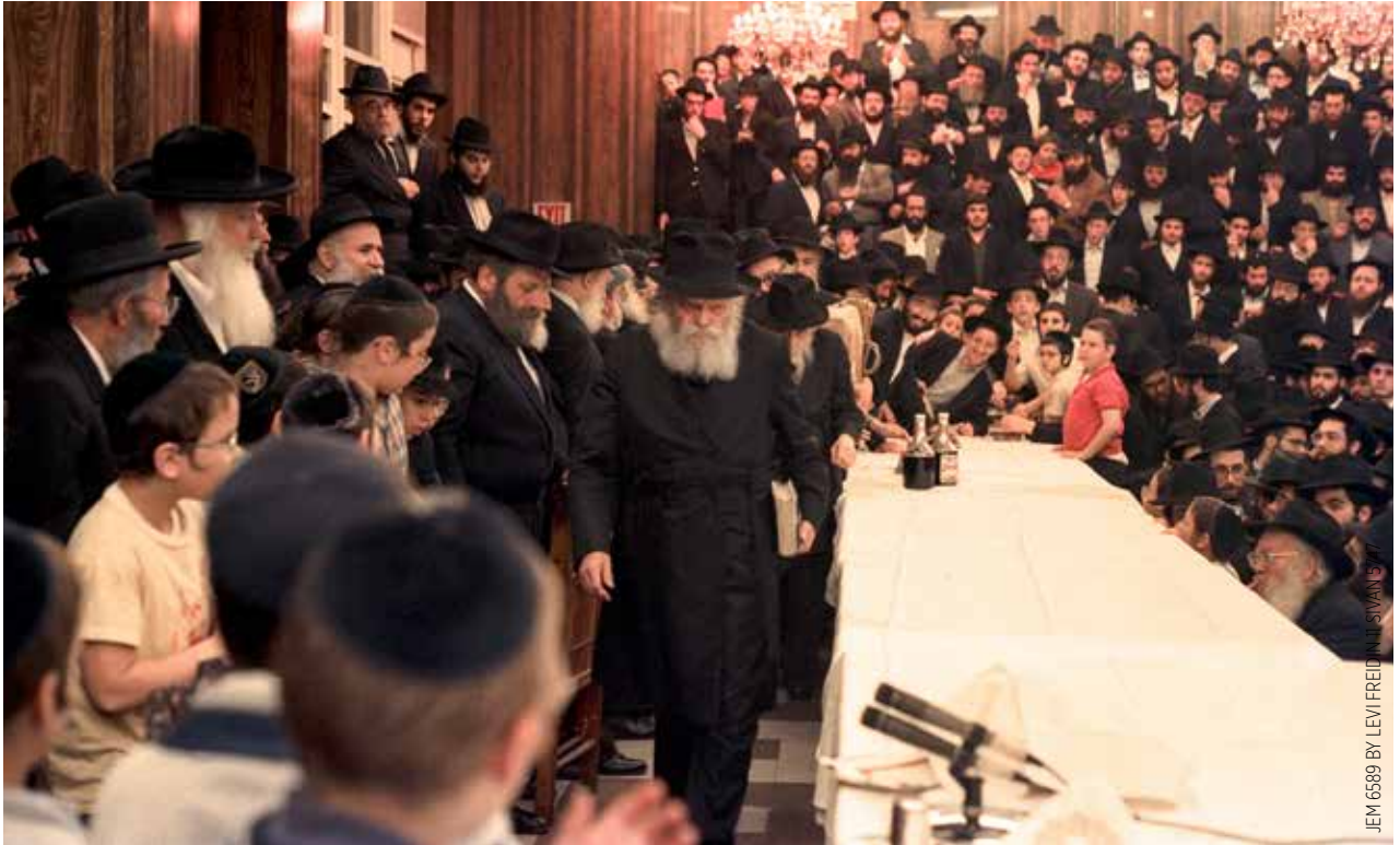
JEM 6589 BY LEVI FREIDMAN/SIVAN 5/17

Special time was also devoted to the presentation of matanos . From the Rebbe's seventieth birthday in 5732*, until 5737*, Chassidim and askanim would approach the Rebbe in between the sichos and present a gift. In 5737*, the Rebbe's seventy-fifth birthday, the amount of matanos presented swelled