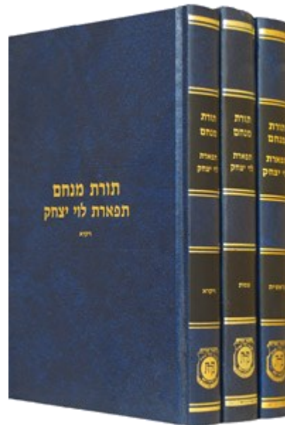
ABOVE: THE THREE VOLUME SET "TORAS MENACHEM - TIFERES LEVI YITZCHOK", A COMPILATION OF THE REBBE'S SICHOS EXPLAINING HIS FATHER'S HA'OROS ON ZOHAR. IT WAS IN VOLUME 2 (SHEMOS) OF THIS SET, THAT THE REBBE INSTRUCTED TO PUBLISH BOTH PICTURES OF RAV LEVI YITZCHOK.

** This article appeared in a previous edition of the Derher. It is reprinted here with additional material in honor of the special Chof Av Edition. **