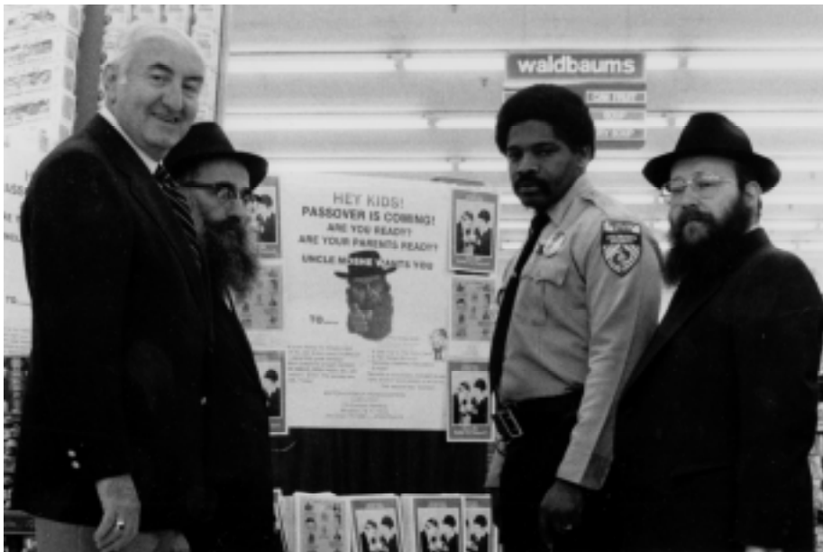
RABBI DOVID RASKIN AND RABBI SHMUEL BUTMAN ARE JOINED BY MAYOR ED KOCH IN ADVERTISING THE MATZAH BALL CONTEST IN WALDBAUM'S SUPERMARKET.