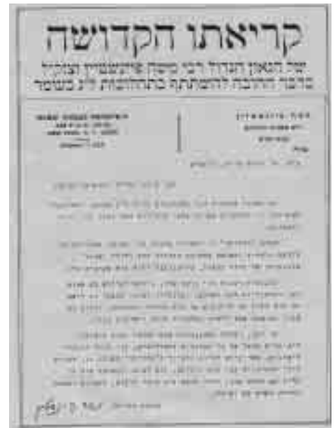
HORAV MOSHE FEINSTEIN'S LETTER ENCOURAGING PARTICIPATION IN THE LAG B'OMER PARADES.