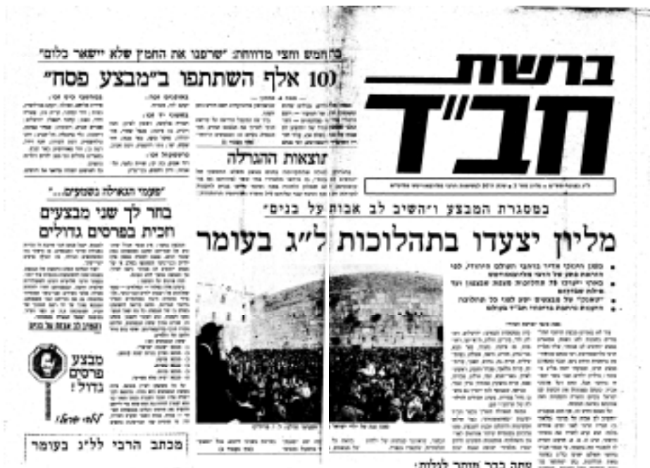
A NEWSPAPER CLIPPING DESCRIBING THE ENORMOUS LAG B'OMER PARADE IN ERETZ YISROEL IN 5740.

There is no explanation to such a phenomenon; hence the name ‘sinna chinnom’ – it has no reason whatsoever!” the Rebbe said. “Thousands of children gath-