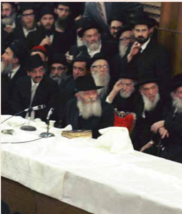
TI NISSAN 5732.

In those years, a Yud-Aleph Nissan farbrengen was not yet the norm. Throughout all the years until 5732, there had only been two Yud-Aleph Nissan farbrengens; once in 5722—the Rebbe's sixtieth birthday, and a short farbrengen in 5731.