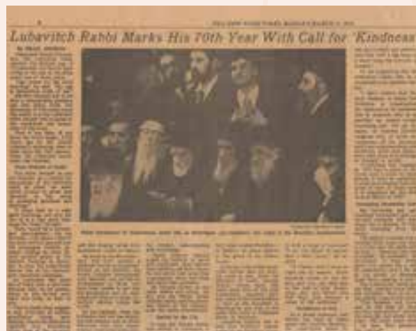
A NEW YORK TIMES ARTICLE “LUBAVITCH RABBI MARKS HIS 70TH YEAR WITH CALL FOR ‘KINDNESS.’”