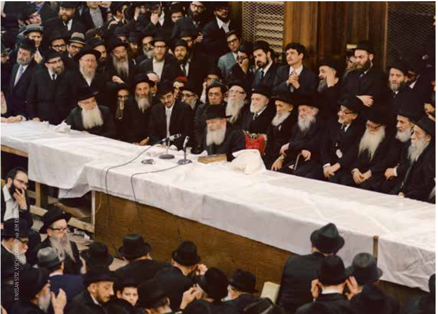
TI NISSAN 5732, Y SCHILDKRAUT

you should be blessed with nachas from children מתוך הרחבה. Moshiach will arrive soon.”