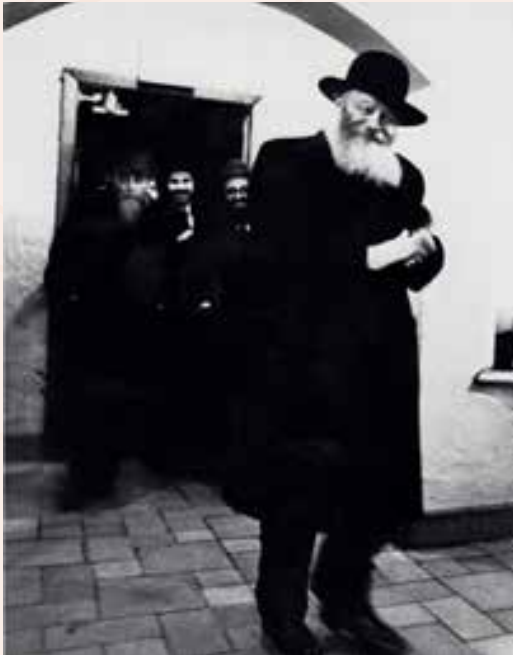
THE REBBE ENCOURAGES THE SINGING AS HE ARRIVES AT 770, YUD ALEPH NISSAN 5732.

Even after the farbrengen, the Chassidim continued to dance with great joy and energy to the new niggun “בך ה' חסית”. During the excitement, they decided to create a circle of dancing around the