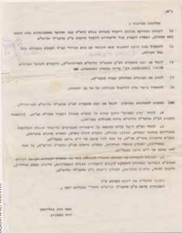
A LIST OF RESOLUTIONS SUGGESTED BY TZACHIN IN ANTICIPATION FOR YUD-ALEPH NISSAN 5732.

wishes in honor of the Rebbe, recognizing his greatness and world leadership.