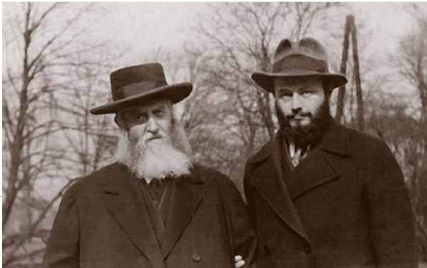
THE FRIERDIKER REBBE AND THE REBBE IN PURKERSDORF, AUSTRIA, FOR THE FRIERDIKER REBBE TO REST. 25 ADAR I 5695.