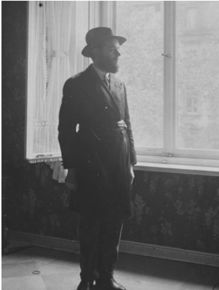
THE REBBE AT THE TIME OF HIS WEDDING, 5689.

certain individual commented, “What? A yorei shomayim like you eats the bread baked here?” (Implying that there was something questionable about the kashrus of that establishment.) From then on, the Rebbe would not eat the bread from that bakery, despite that this rumor eventually proved to be false.