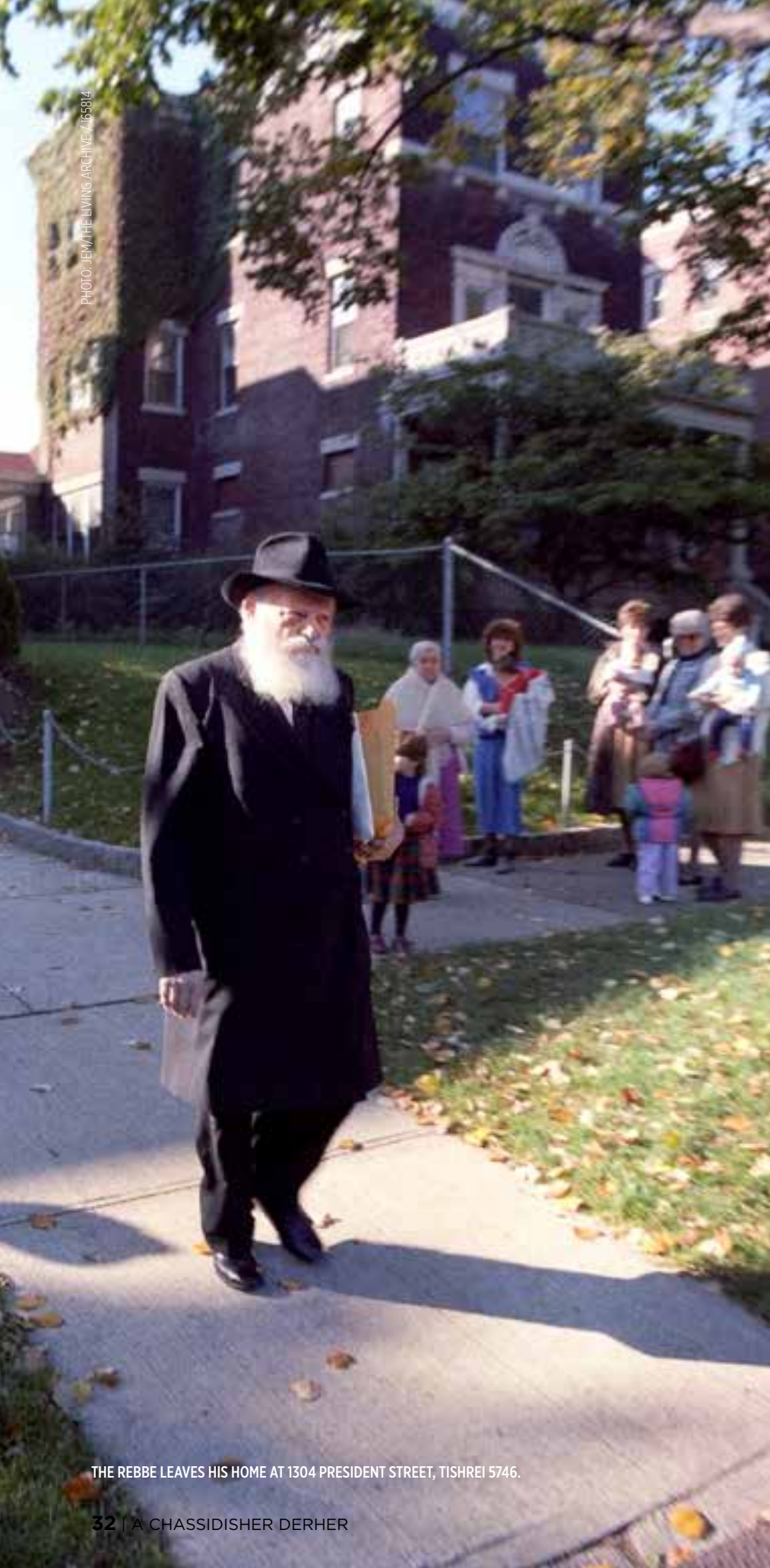
THE REBBE LEAVES HIS HOME AT 1304 PRESIDENT STREET, TISHREI 5746.

Contemplate deeply into the precious pearl Hashem has given you, may it be for many long years with all good. May Hashem grant you the chochama, bina, and daas to properly and truly understand this concept. 12