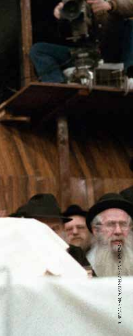
10 NISSAN 5744, YOSSIMELAMED VIA JEM 125465