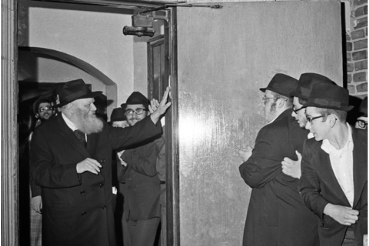
THE REBBE LEAVES 770 FOLLOWING THE FARBRENGEN OF YUD-ALEPH NISSAN 5737*.

on Yud-Aleph Nissan and went to visit some baalei batim .