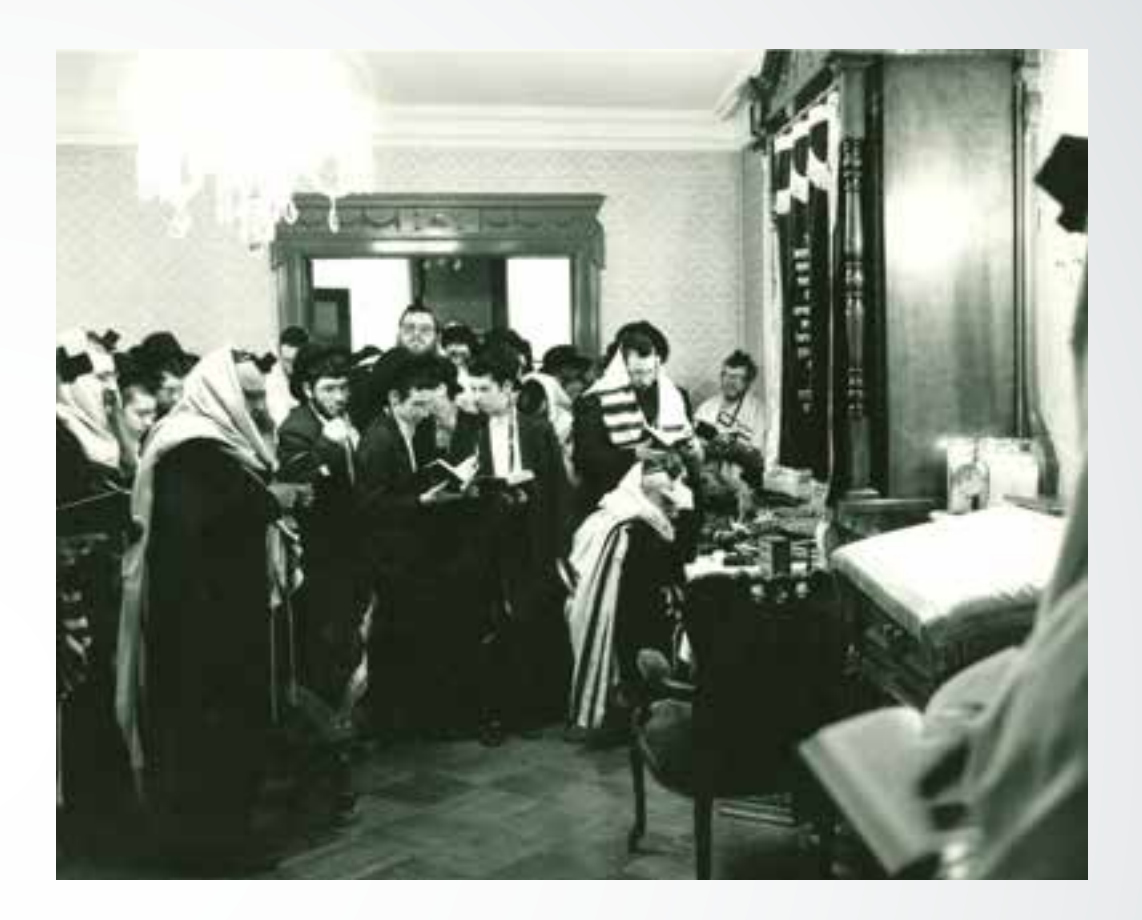
A raffle rotation was arranged for bochurim to receive the chance to participate in the tefillos .