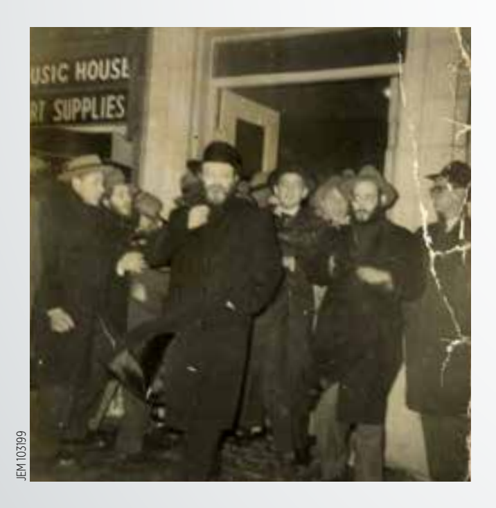
The Rebbe heads home from the Gayheart Hall.