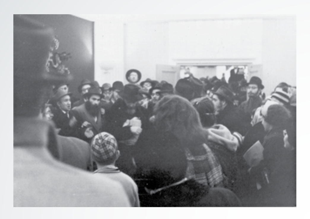
Following a farbrengen, the Rebbe exits through the hall's lobby.