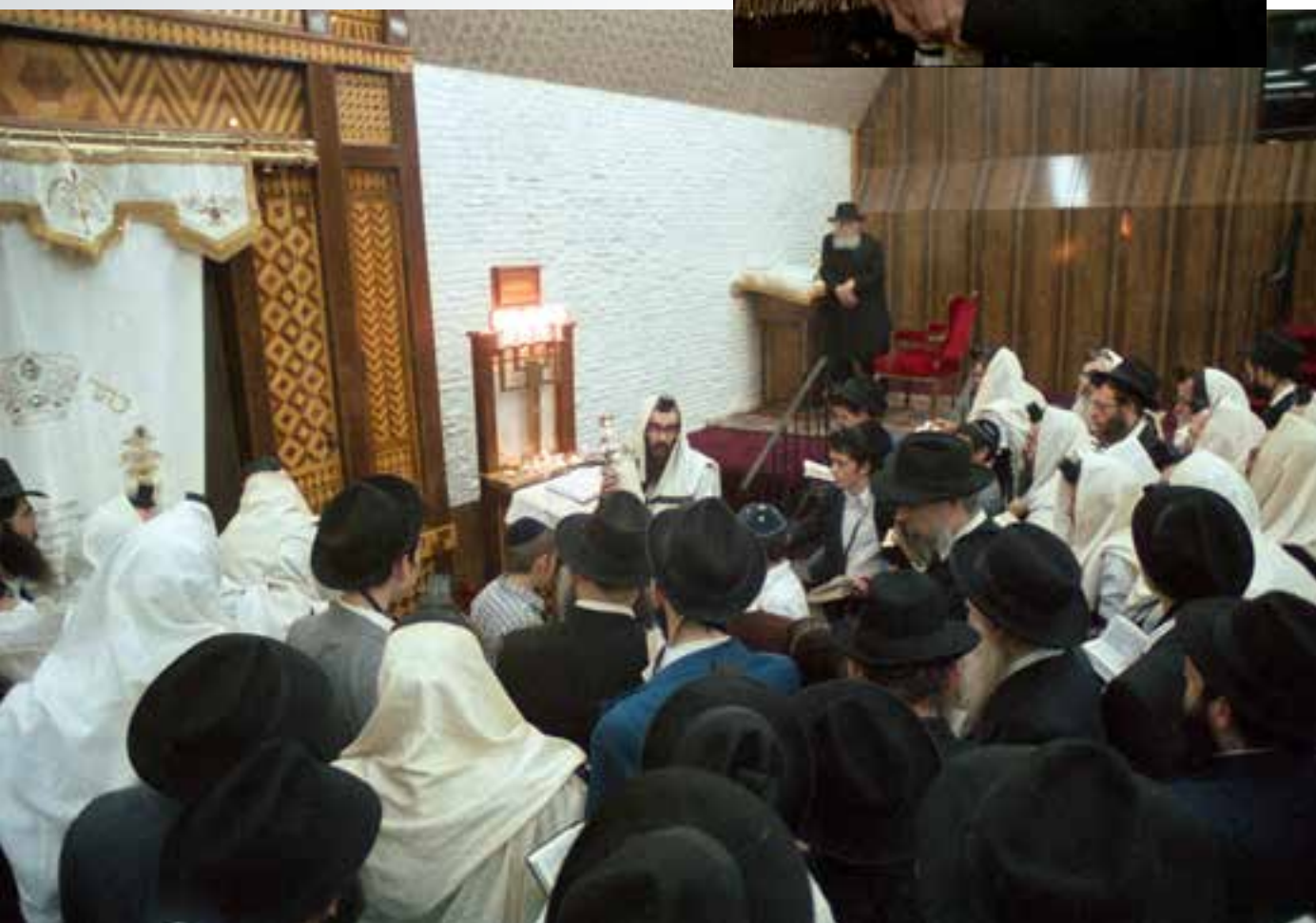
11 TISHREI 5746