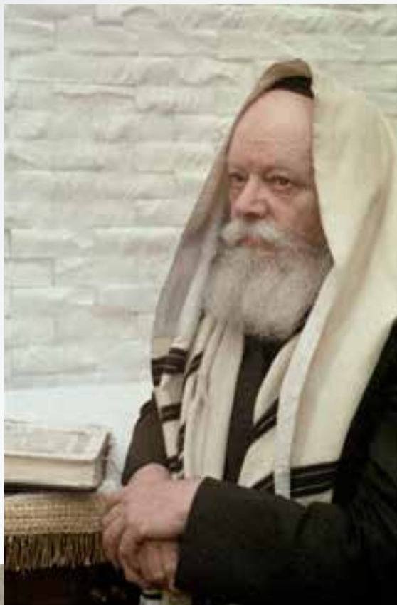
21 TISHREI 5745

The Rebbe faced the aron kodesh while reciting “ Vayehi Binsoa ” and “ Brich Shmei ” from the siddur . As the sefer Torah was taken out, the Rebbe would follow it with his gaze until it was placed on the bima .