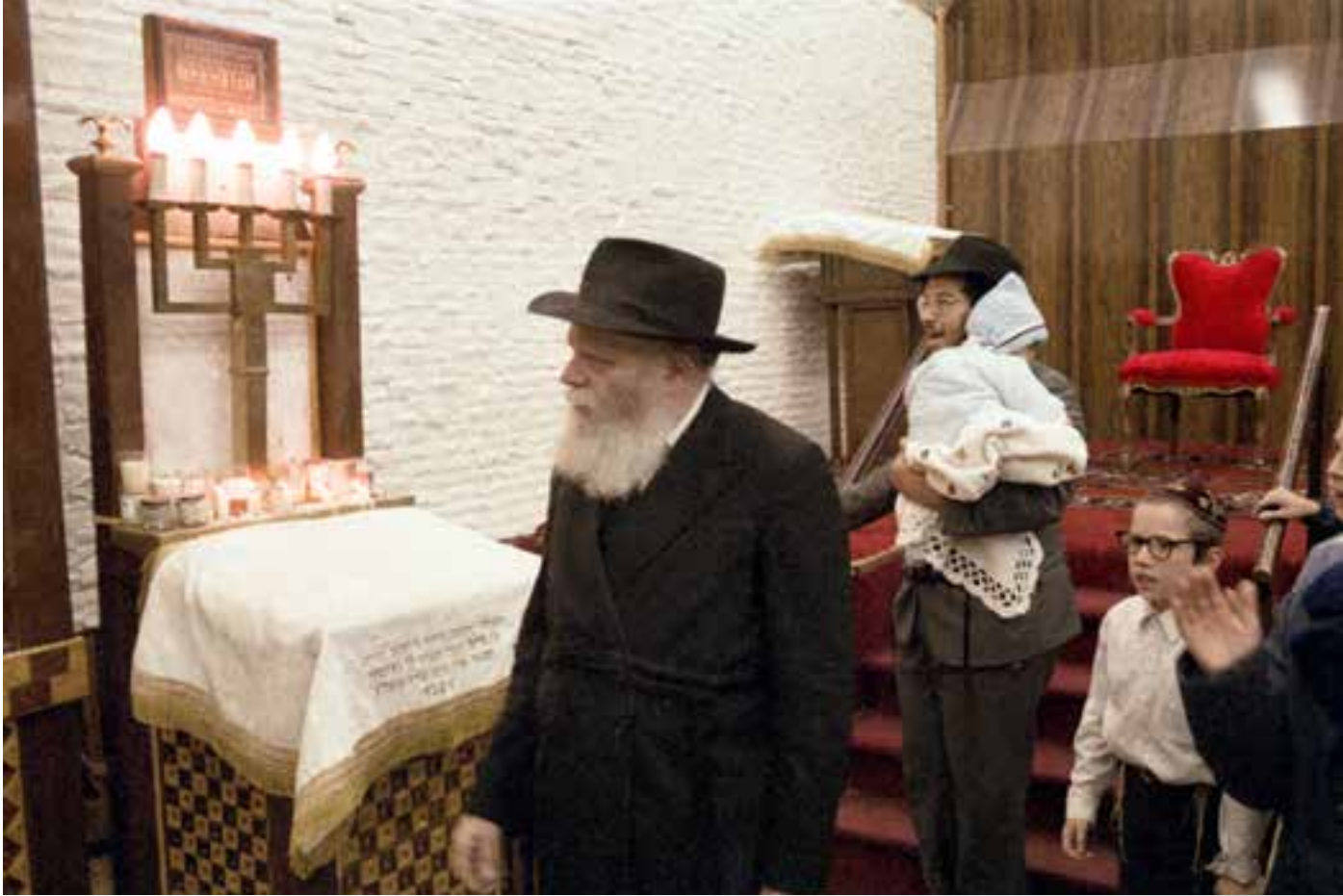
The Rebbe watched the Torah until it was returned to the aron. (Note: When attending kriah in the small za , the Rebbe would recite Tehillim at this time)