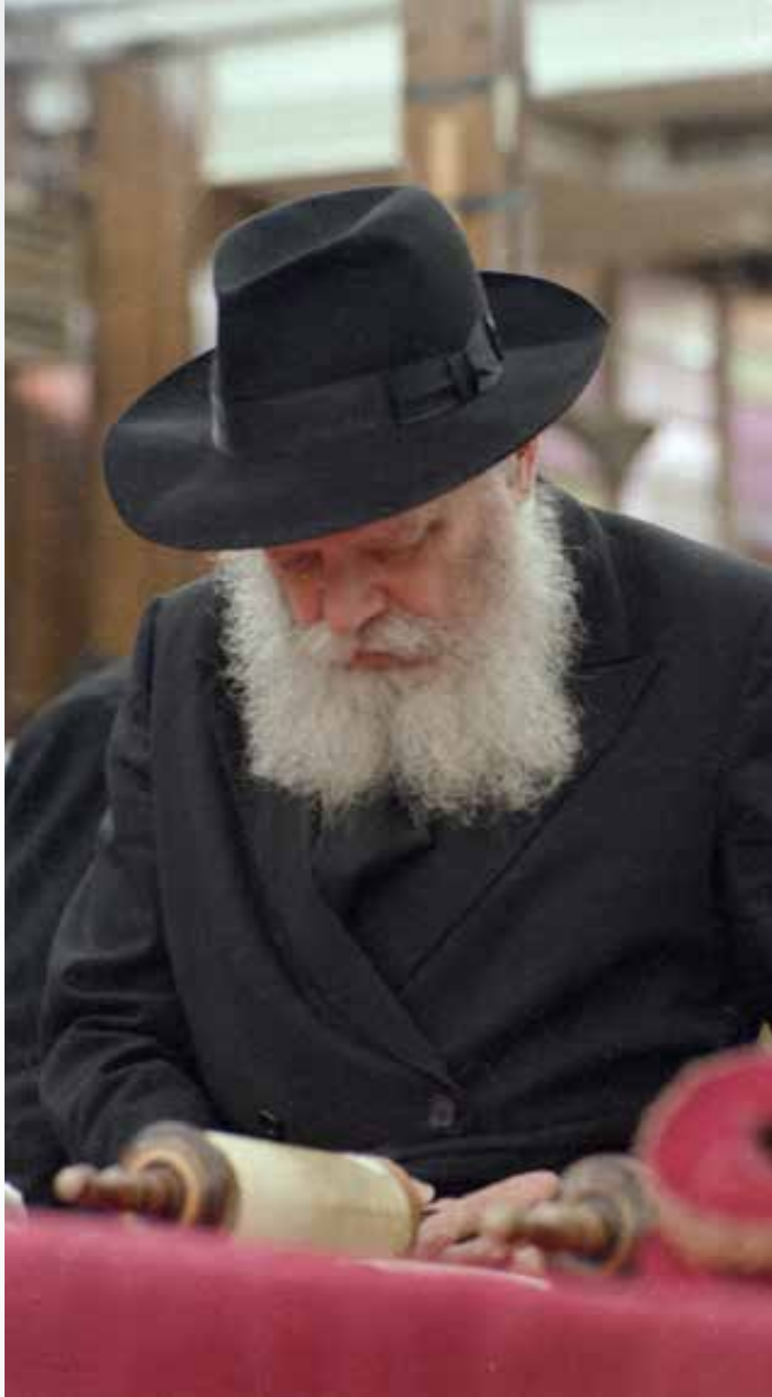
1 CHESHVAN 5742

During the kriah , the Rebbe would read inside from the sefer Torah at the same pace as the baal koreh , while holding onto the right eitz chaim with both hands.