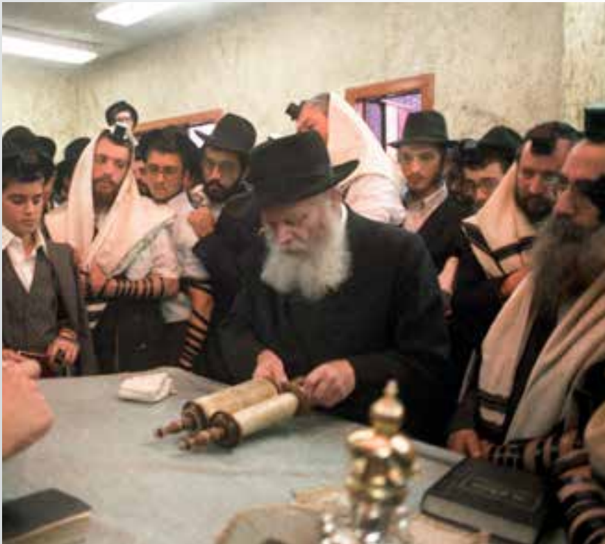
30 TISHREI 5744

After the aliyah , the Rebbe would again kiss the portion of the kriah with the tallis or gartel , this time in the opposite order (end, beginning, end) and then recite the bracha while lifting the atzei chaim by the words “ברוך אתה ה'; תורת אמת, ברוך אתה ה'