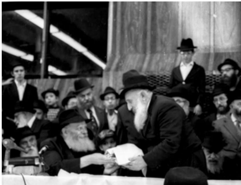
LEVI FREIDIN VIA JEM 1505840