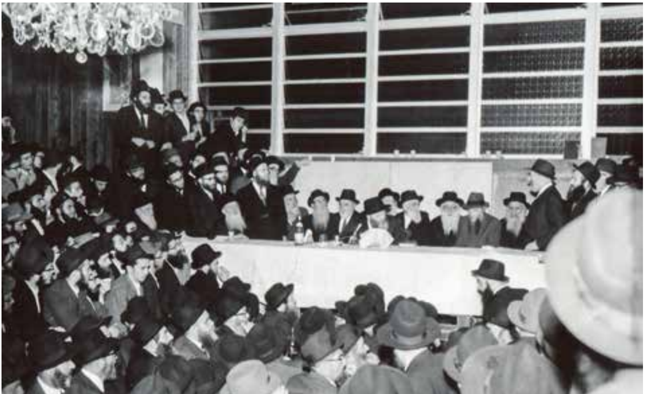
FARBRENGEN EREV ROSH HASHANAH 5723*