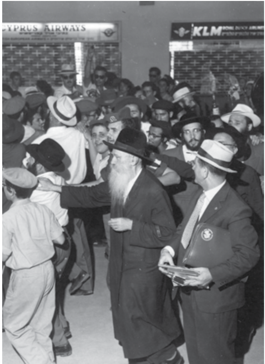
CHASSIDIM DANCE BEFORE EMBARKING ON THE CHARTERED FLIGHT TO NEW YORK, ELUL 5721*

This was especially true in dor hashvi'i . Remarkable giluyim filled the days from Shabbos Selichos through Shabbos Bereishis. Handing the Rebbe a pan , hearing the Rebbe's tekios , experiencing Napoleon's March and hakafos , are just a few examples of