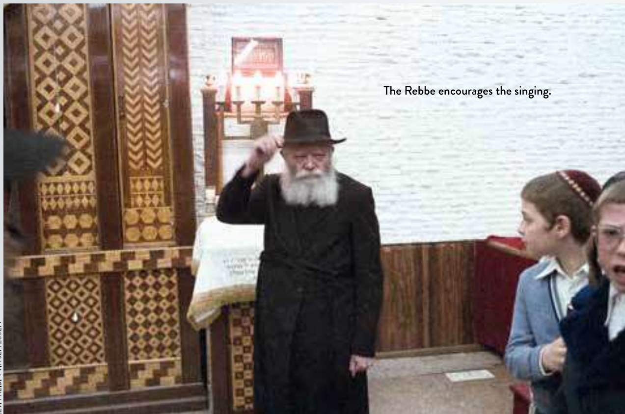
The Rebbe encourages the singing.