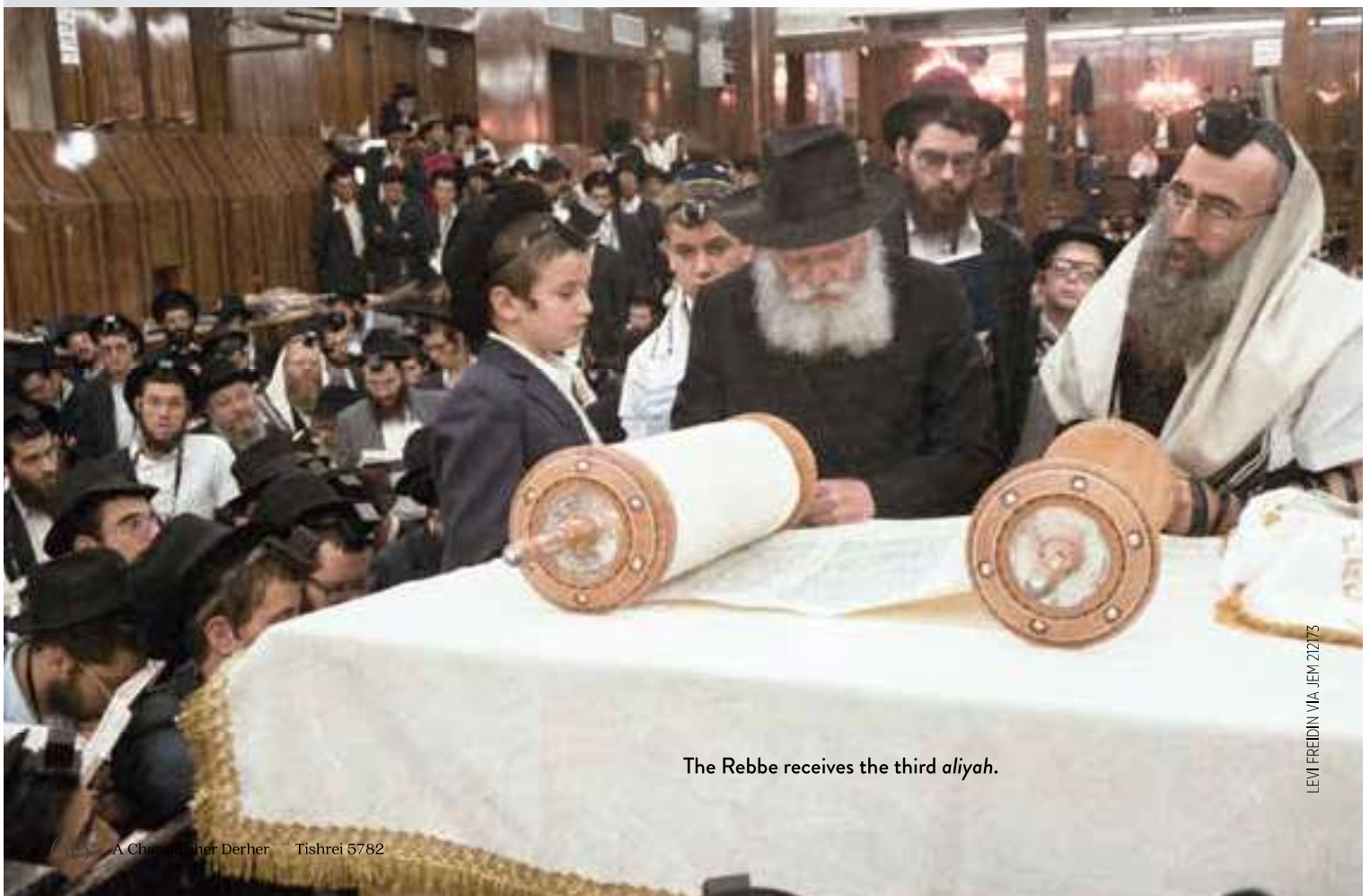
The Rebbe receives the third aliyah .