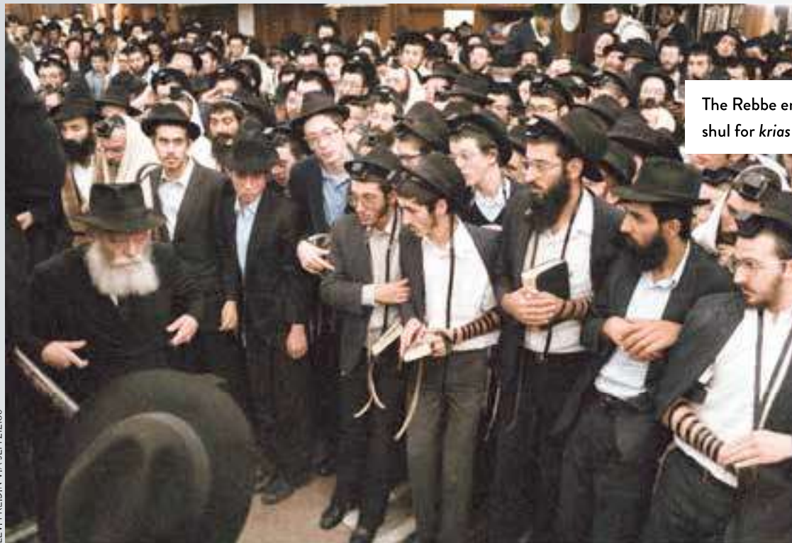
The Rebbe enters the main shul for krias HaTorah .