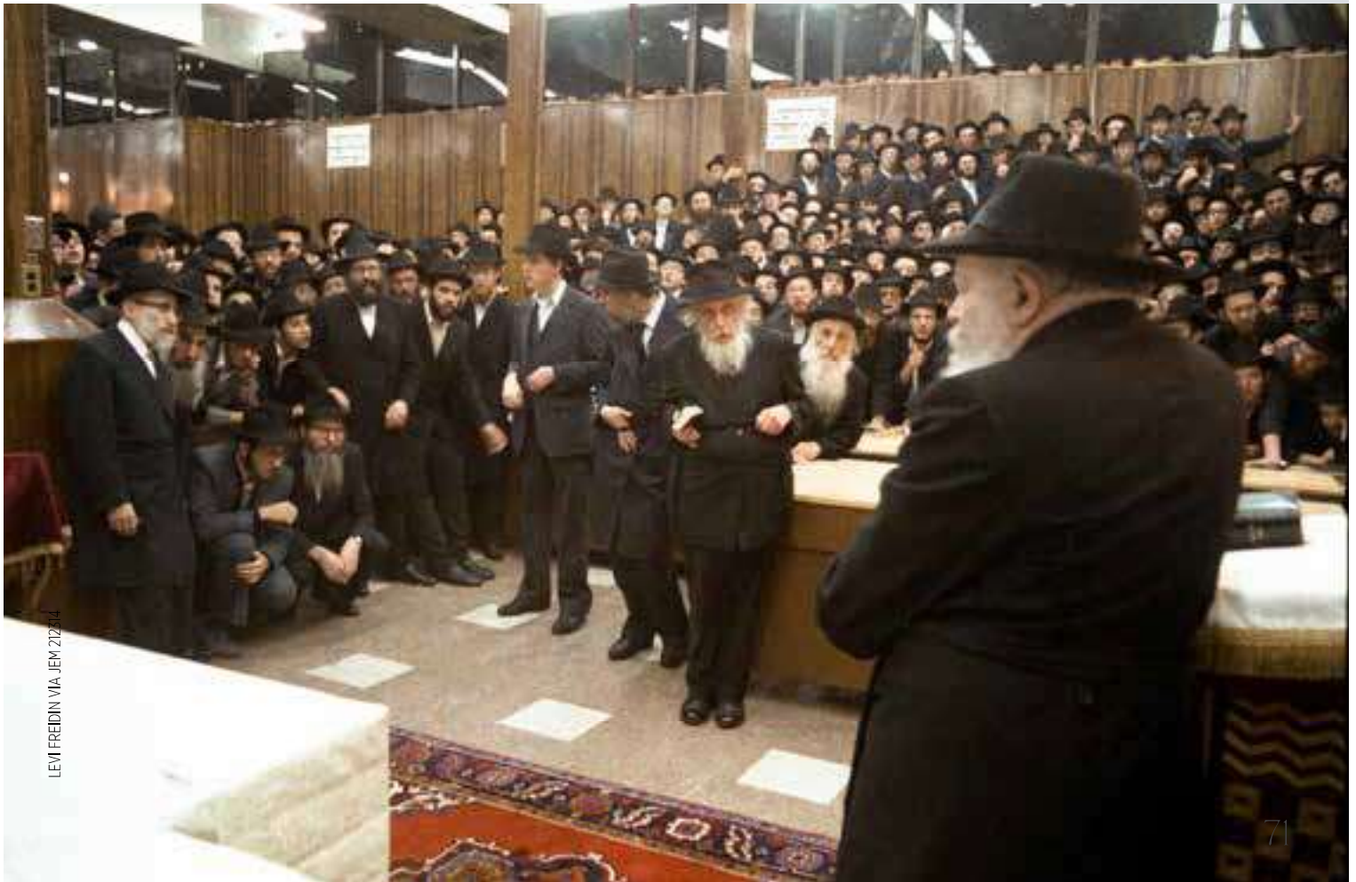
LEVI FREIDIN VIA JEM 212314