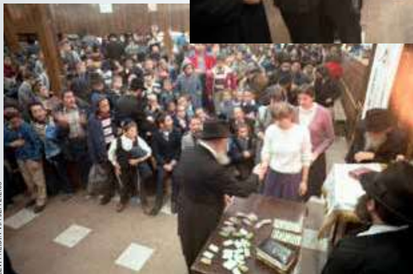
LEVI FREIDIN VIA JEM 212163