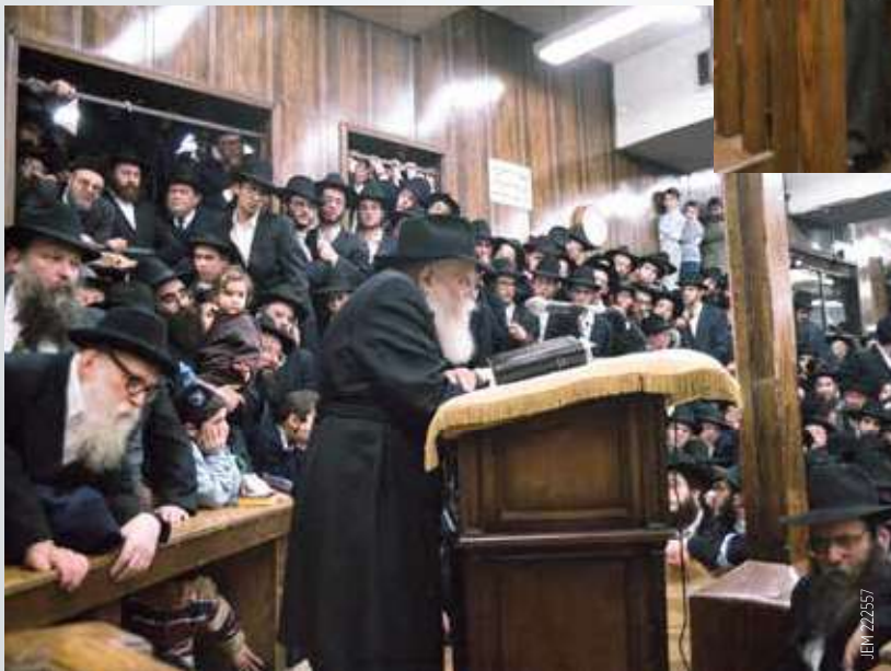
After Maariv, the Rebbe ascended to the shtender and recited a sicha about the Rebbetzin and the lessons we should take from her life.