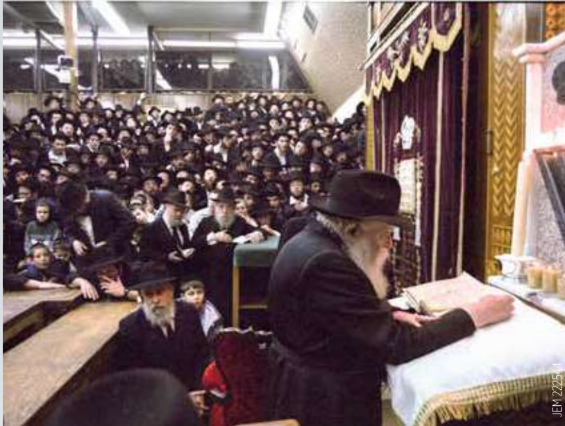
Concluding the final kaddish.