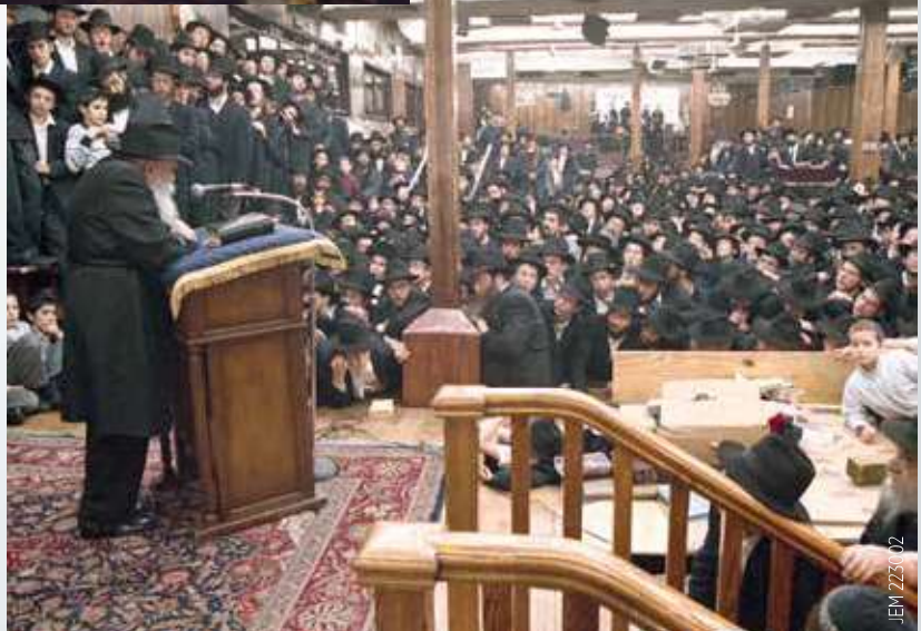
After many hours at the Ohel, the Rebbe returned to 770 and shortly thereafter entered the shul for Mincha.