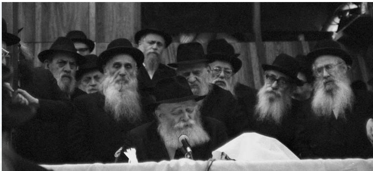
11 NISSAN 5746

mean it. She then informed the Rebbe that her heart is in pain, and the Rebbe responded, "We must be happy as there is a wedding soon."