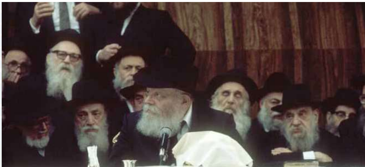
10 SHEVAT 5746*