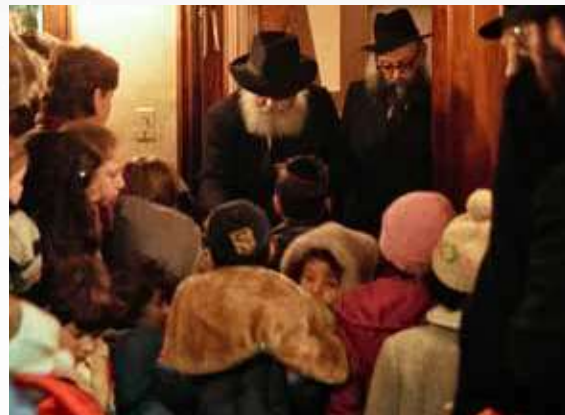
29 KISLEV 5746

In the first sicha of the farbrengen, the Rebbe raised his voice and passionately addressed the shturem that the Friediker Rebbe had made regarding teaching children kriah . He took a strong stance that children should be taught how to read with the traditional “ kamatz alef uh ” method, and to avoid the adoption of supposedly faster modern approaches.