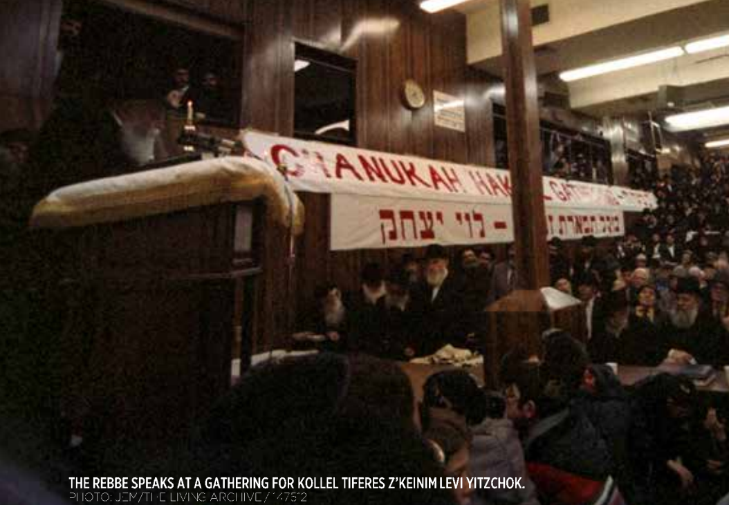
THE REBBE SPEAKS AT A GATHERING FOR KOLLEL TIFERES Z'KEINIM LEVI YITZCHOK.