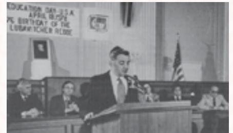
VICE PRESIDENT WALTER F. MONDALE ADDRESSES THE INAUGURATION EVENT OF EDUCATION DAY U.S.A., IN THE WHITE HOUSE, 11 NISSAN 5738

the students of Beis Sefer L’milcha , who were returning to Israel the next day, as well as to many of the shluchim and guests who had come from afar, all the while encouraging the joyous singing.