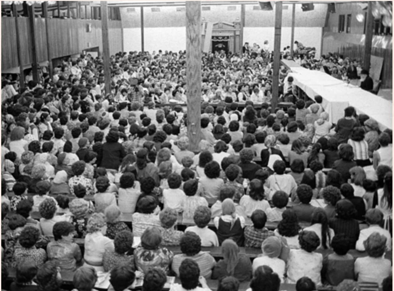
YOSSI MELAMED via JEM 139981