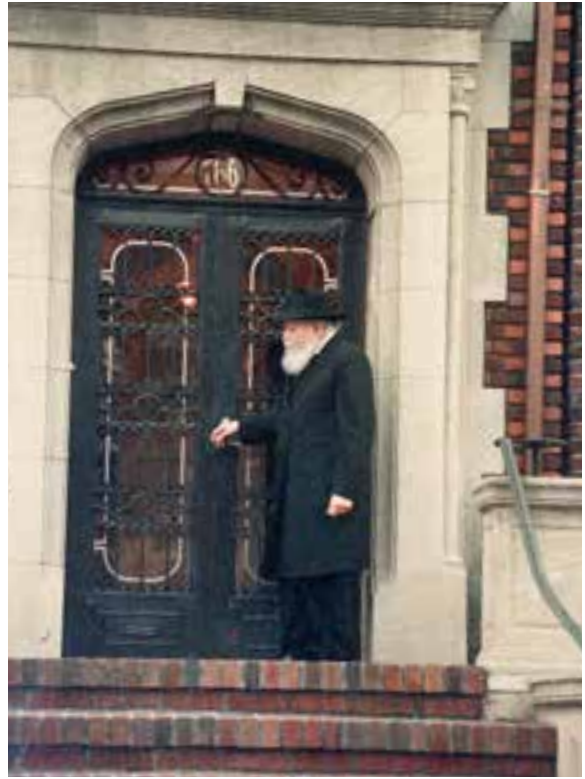
LEVI FREIDIN via JEM 209393