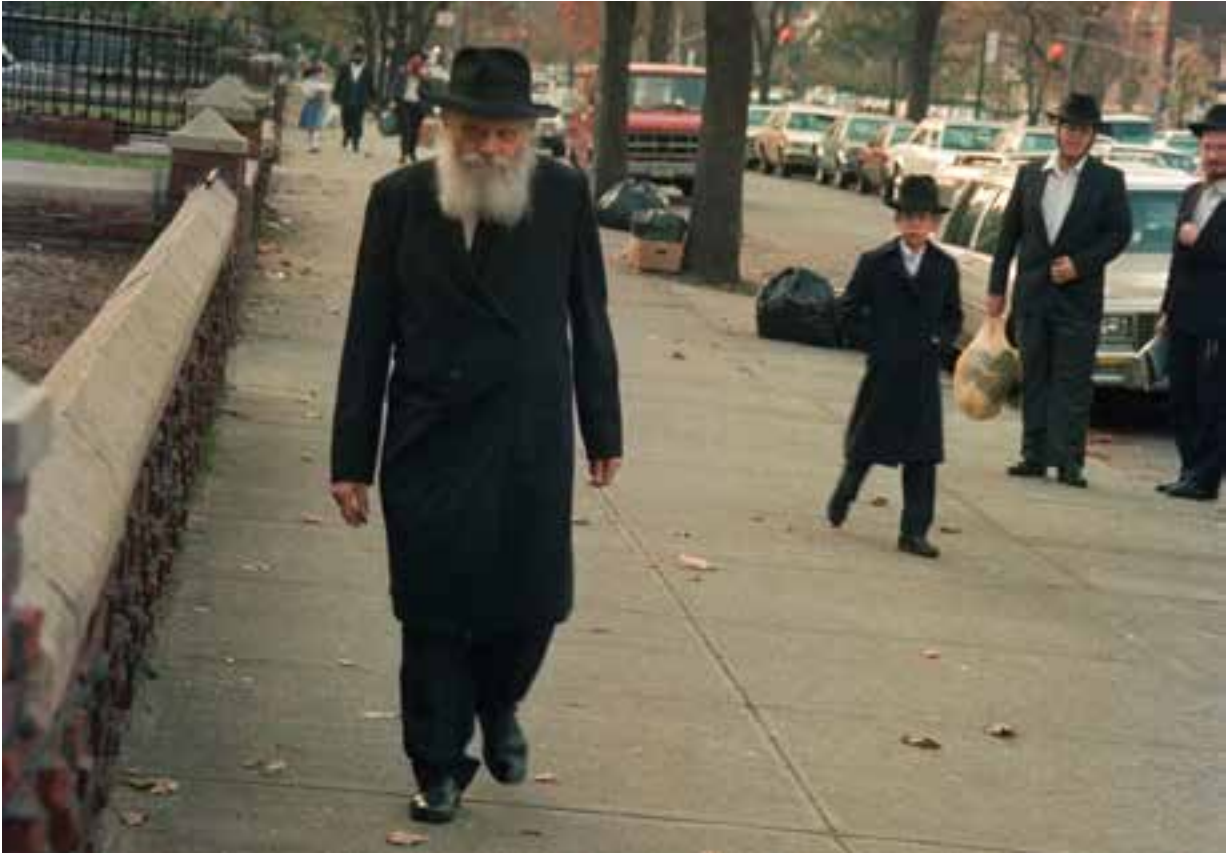
LEVI FREIDIN via JEM 20220