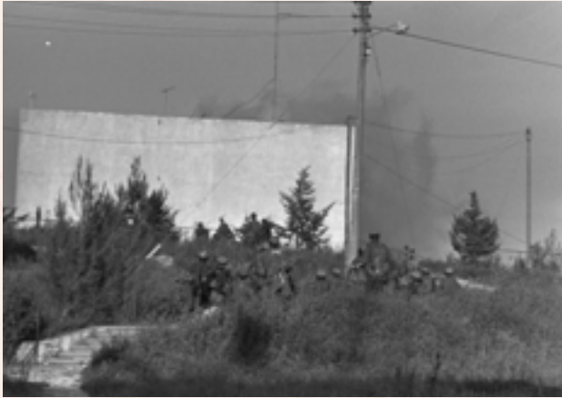
ISRAELI SOLDIERS BEGIN THE ASSAULT ON THE HIJACKED SCHOOL BUILDING IN MAALOT, ISRAEL.

broke into the school and rescued the children. In the ensuing chaos, the terrorists lobbed grenades towards the hostages and 22 children were killed, r"l . The next day, a number of the mezuzos in the school were found to be possul , and as the death toll rose, so did the number of possul mezuzos.