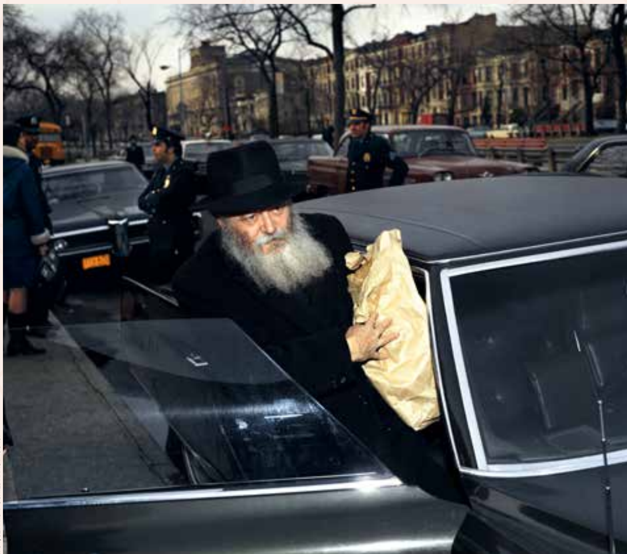
5734, 108461

Regarding the pushkas that were being distributed as part of the mivtzoim , the Rebbe said they should not have an address where to send the money, so that people shouldn't think that Lubavitch is trying to make money from this. Likewise, the pushkas should have pictures of