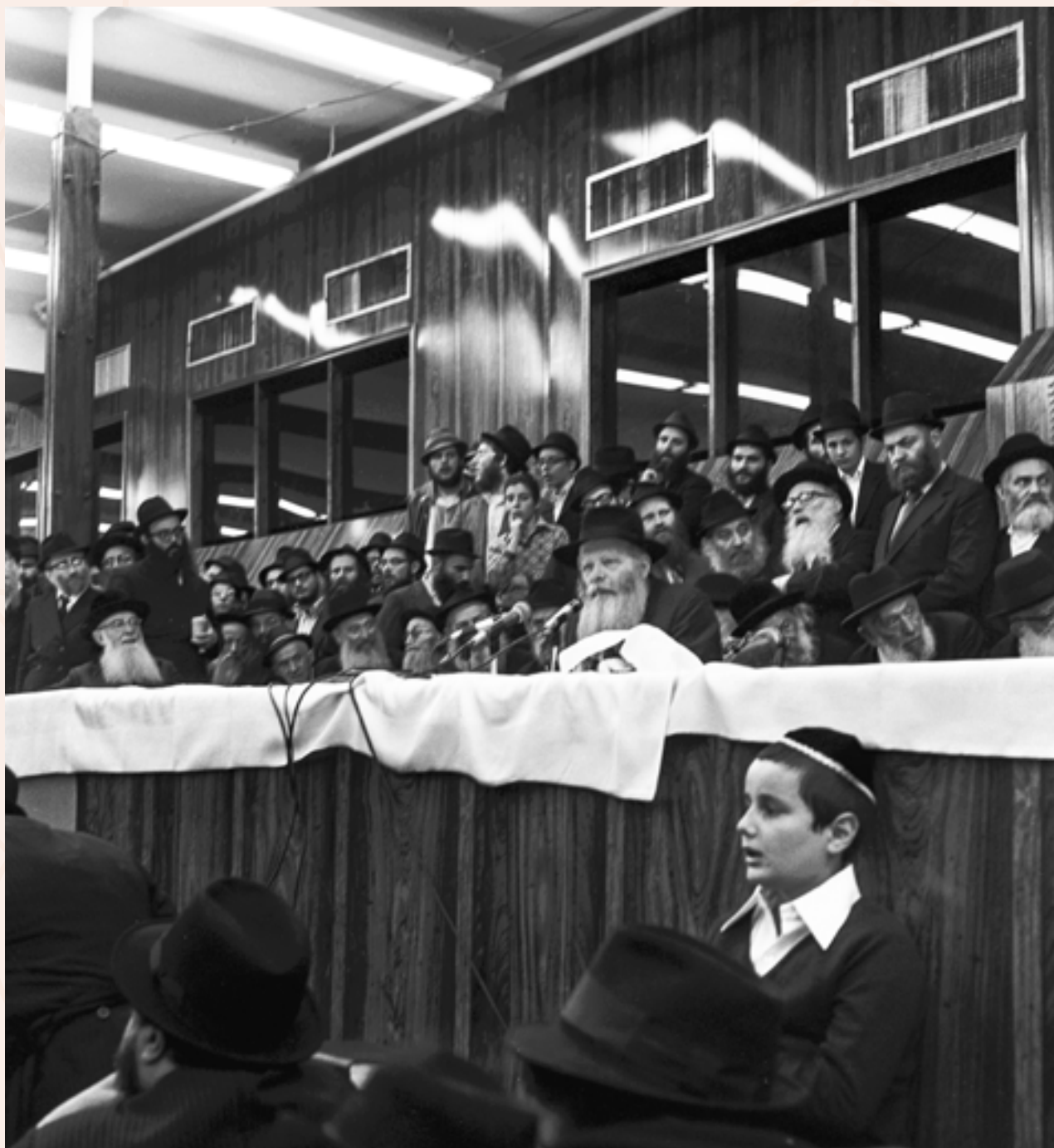
20 AV 5734

[Later on, this became a regular occurrence, and by virtually every weekday farbrengen in the 5740s, the Rebbe distributed dollars for tzedakah through the tankistin .] T