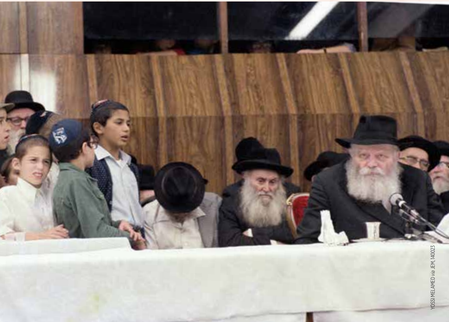
YOSSI MELAMED via JEM, 140023