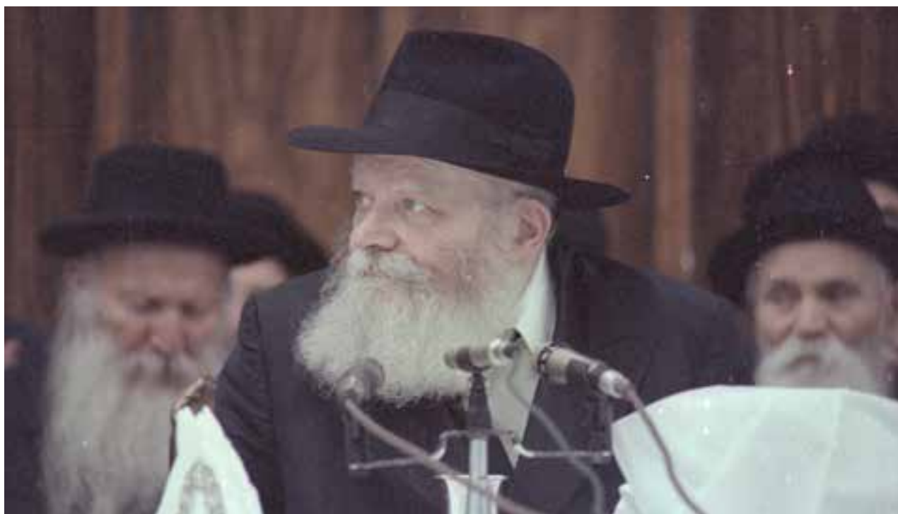
LEVI FREIDIN via JEW 189916

The only directive the schools offer today is: Don't get caught.