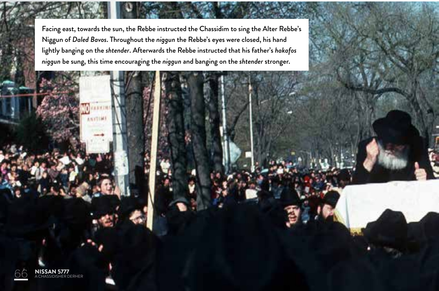
Facing east, towards the sun, the Rebbe instructed the Chassidim to sing the Alter Rebbe's Niggun of Daled Bavos . Throughout the niggun the Rebbe's eyes were closed, his hand lightly banging on the shtender . Afterwards the Rebbe instructed that his father's hakafos niggun be sung, this time encouraging the niggun and banging on the shtender stronger.