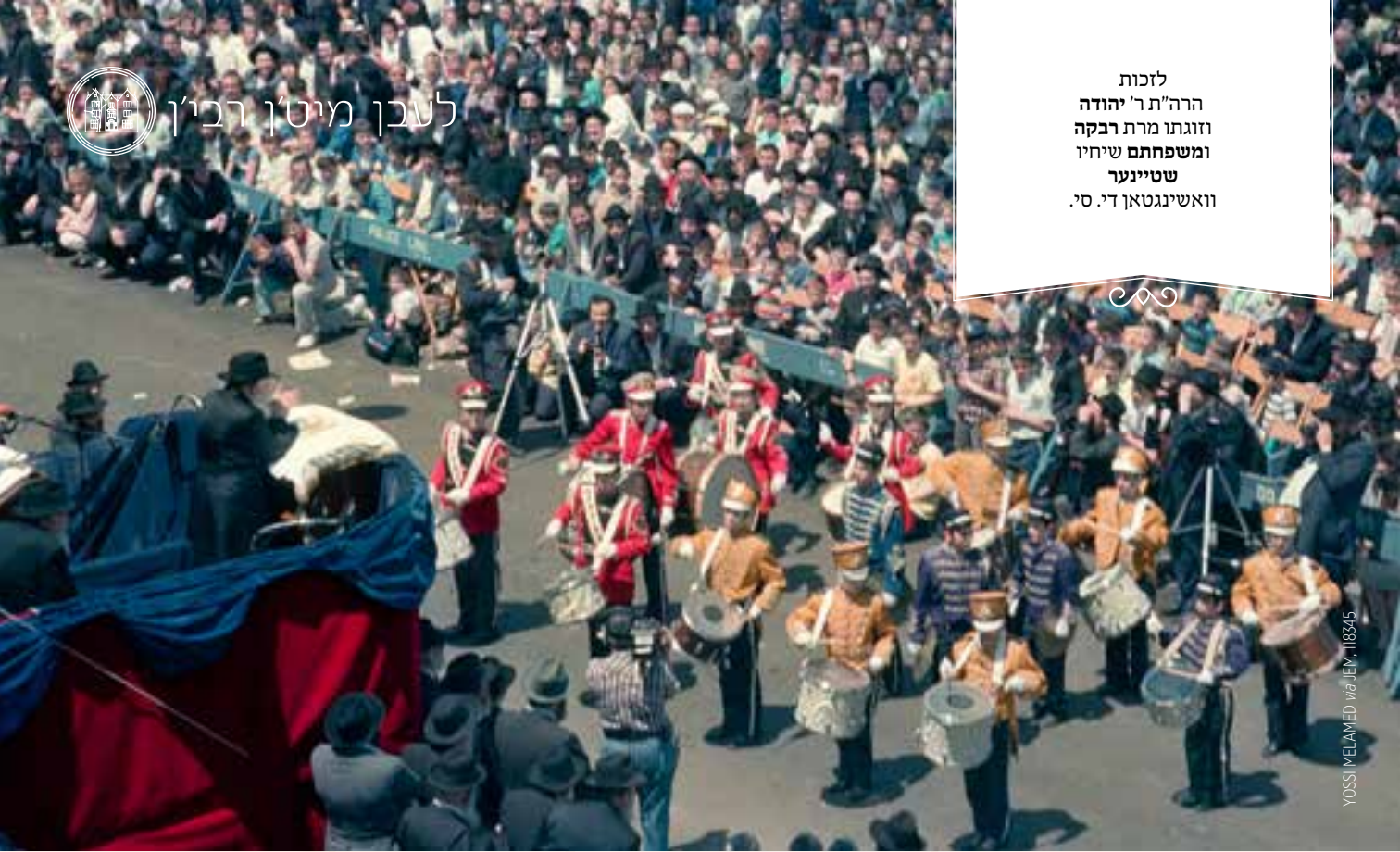
YOSSI MELAMED via JEM 118345