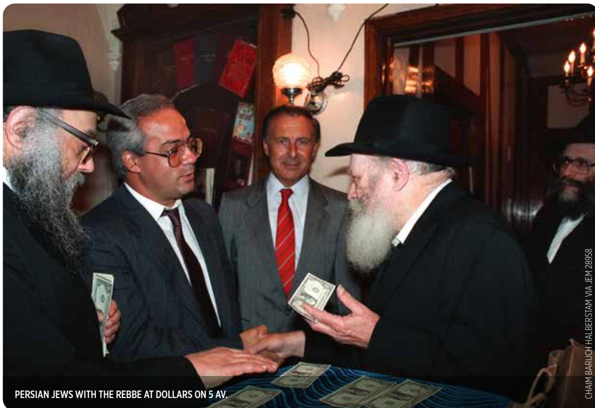
PERSIAN JEWS WITH THE REBBE AT DOLLARS ON 5 AV.

After Maariv, the Rebbe said a sicha , emphasizing the