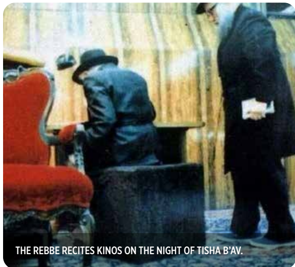
THE REBBE RECITES KINOS ON THE NIGHT OF TISHA B’AV.

The Rebbe came down for Shacharis holding his Siddur and Kinos. Although the Rebbe didn’t daven with the minyan 1 , he had his Siddur open throughout, occasionally turning a few pages to keep up with the Chazzan.