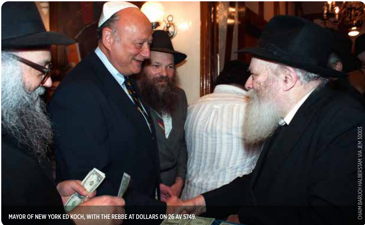
MAYOR OF NEW YORK ED KOCH, WITH THE REBBE AT DOLLARS ON 26 AV 5749.