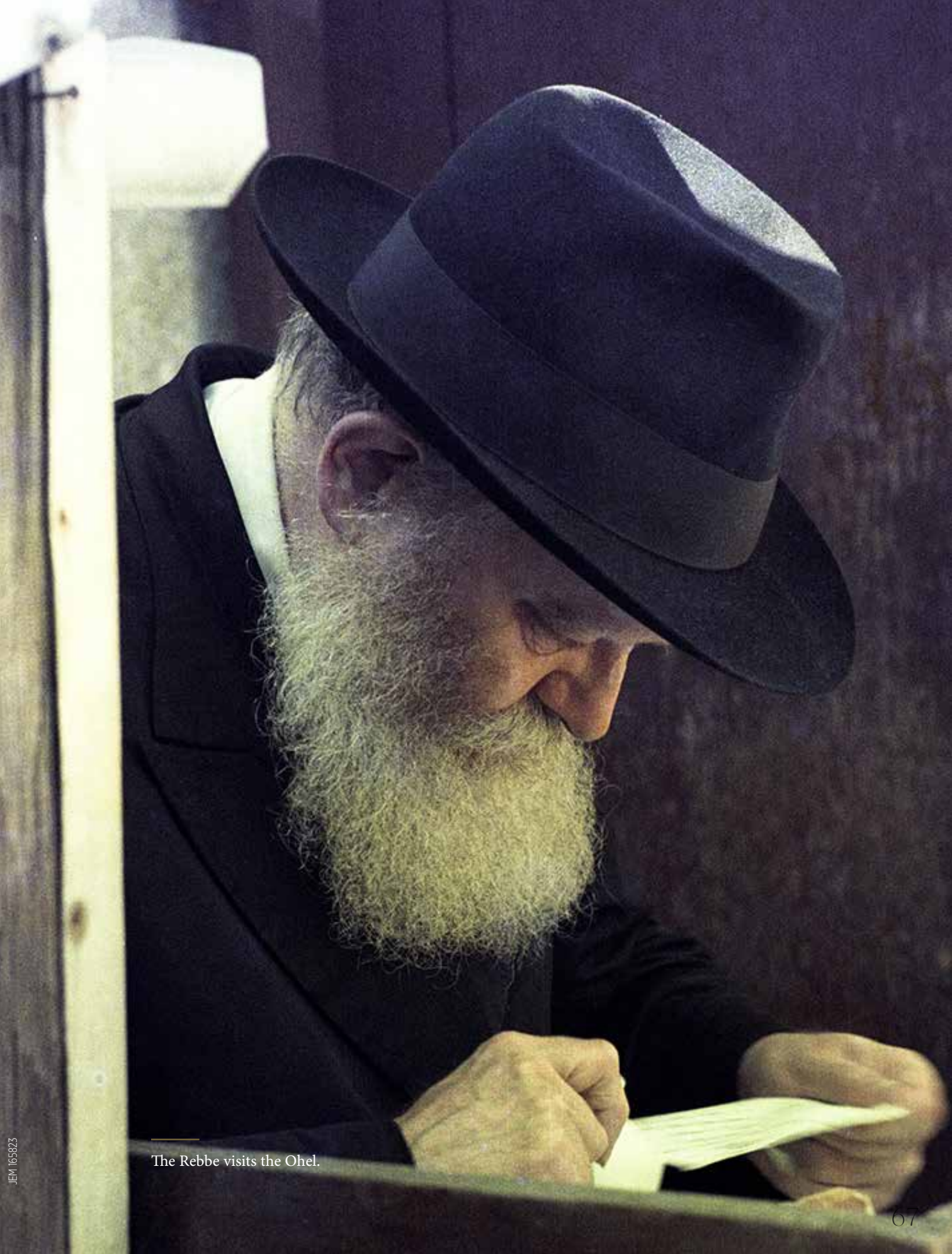
The Rebbe visits the Ohel.