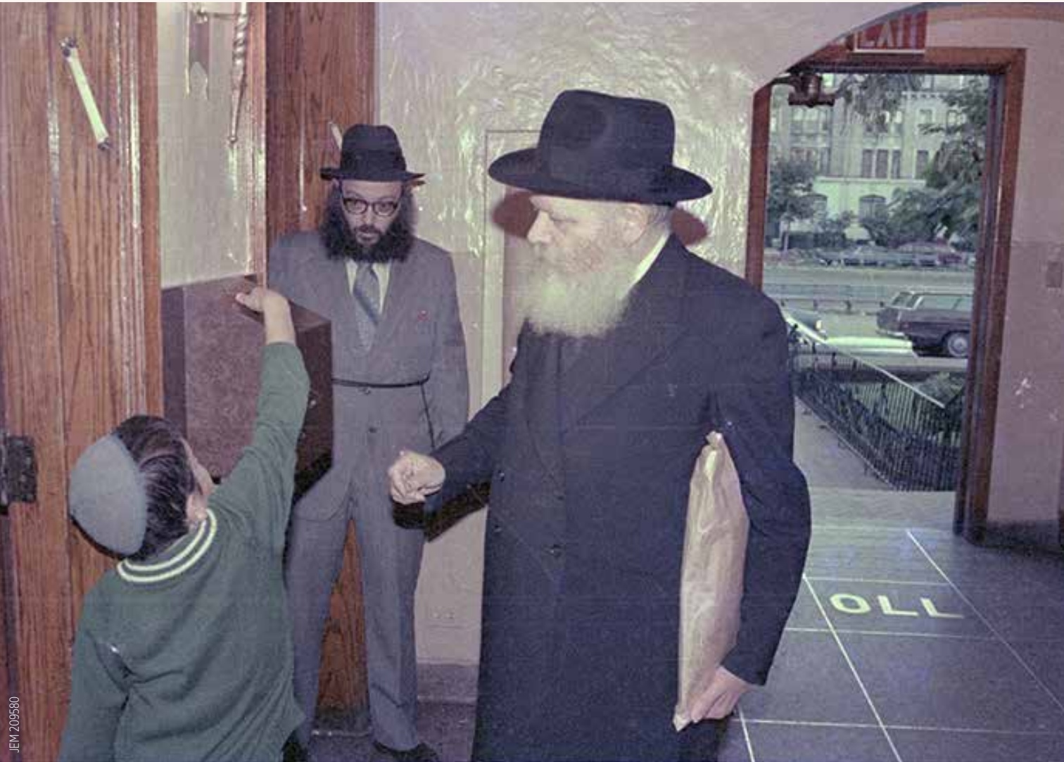
Early in the morning, the Rebbe arrives at 770.