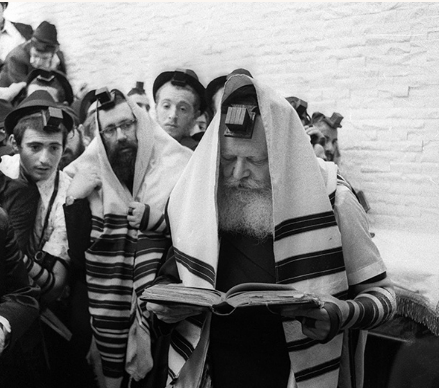
After Shacharis, the Rebbe performs Hataras Nedarim.