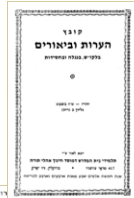
QUESTIONS POSED BY THE REBBE AT SHABBOS FARBRENGENS WERE ADDRESSED IN THE KOVTZIM OF HA'AROS.

In the second sicha , the Rebbe explained that there is significance to today's date, Chof-Daled Shevat, as well, saying that there is no need to search for what's special about Chof-Daled Shevat, as it is already compiled in the sefer "Dvar Yom B'yomo." The Rebbe pointed this out, he explained, to emphasize that there is no reason not to learn from the new compilation-style seforim that have been published recently. There is nothing to be ashamed