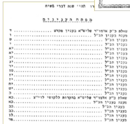
A KOVTZ PRINTED FOR SHABBOS PARSHAS YISRO - 15 SHEVAT 5744.