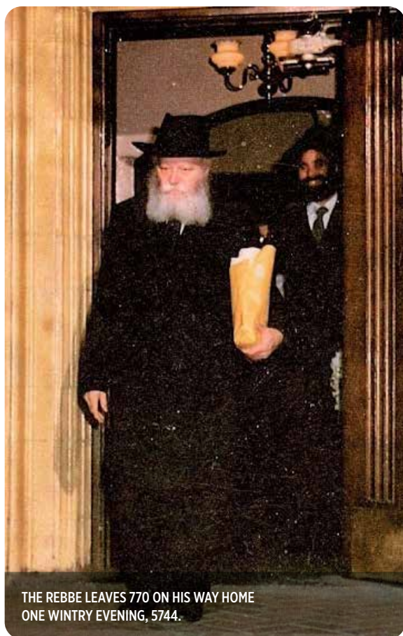
THE REBBE LEAVES 770 ON HIS WAY HOME ONE WINTRY EVENING, 5744.

In the evening, when the Rebbe left 770, he noticed a guest standing outside without a coat despite the frigid winter weather. The Rebbe signaled his surprise that the individual wasn’t wearing a coat, and motioned for him to go inside.