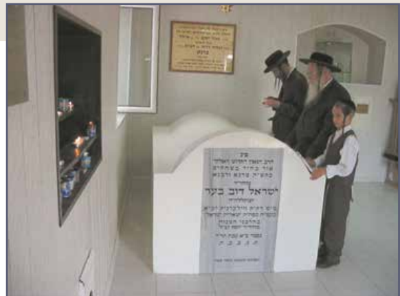
TZIYUN OF REB YISROEL OF VILEDNIK

Reb Yisroel Dovber of Vilednik, known as "the Viledniker" was renowned as a great Rebbe and baal mofes (miracle worker). He was a disciple of Reb Mordechai of Chernobel, and lived during the same period as the Tzemach Tzedek. Numerous stories of his have become part of Chabad lore. The Tzemach Tzedek was once asked how it was possible that the Viledniker has ruach hakodesh. After all, the Rashba states that one who doesn't know how to learn cannot attain ruach hakodesh. The Tzemach Tzedek responded: "The Viledniker is a ga'on!"