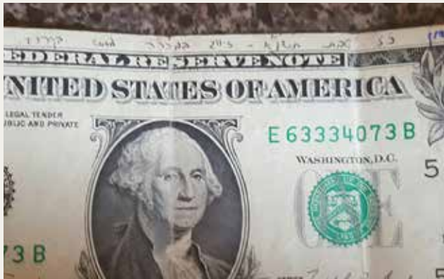
THE DOLLAR OF THE REBBE WITH THE BRACHA FOR AN IMMINENT SHIDDUCH.

this wonderful bracha and suggested the same “deal” in the merit of my second daughter. Baruch Hashem, my eldest daughter’s wedding was a beautiful simcha , and on the last day of Sheva Brachos, my second daughter got engaged. I had not even finished paying the second pledge.