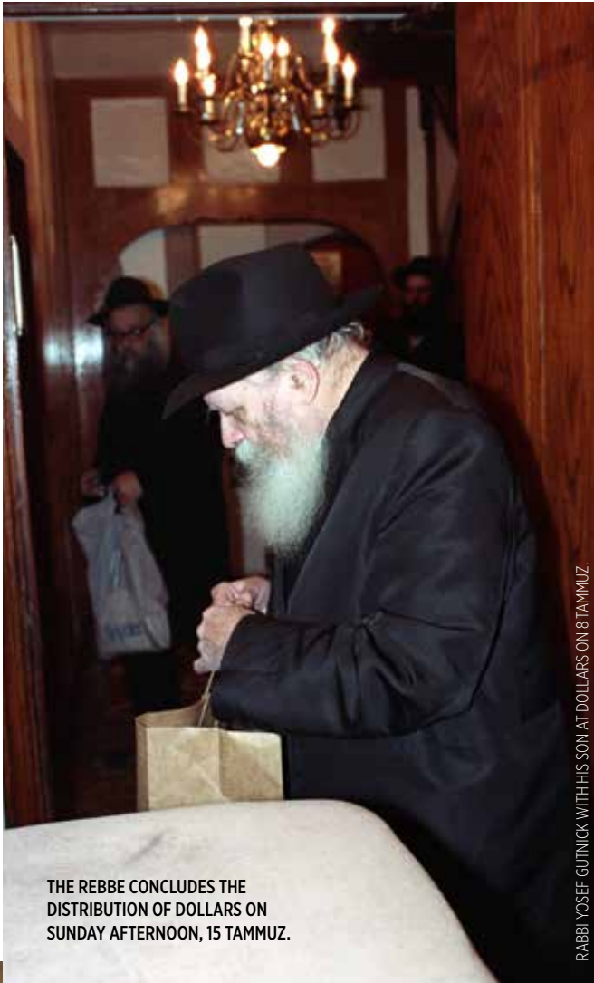
THE REBBE CONCLUDES THE DISTRIBUTION OF DOLLARS ON SUNDAY AFTERNOON, 15 TAMMUZ.