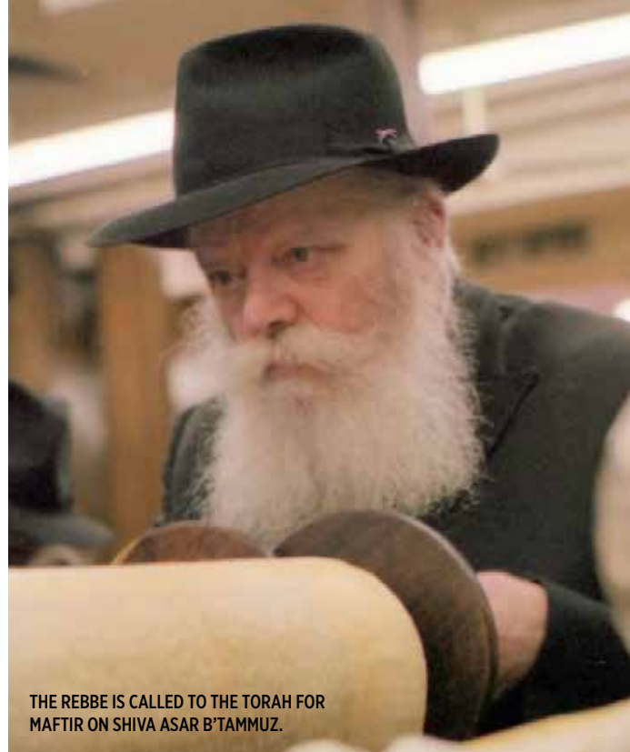
THE REBBE IS CALLED TO THE TORAH FOR MAFTIR ON SHIVA ASAR B'TAMMUZ.

Members of the administration of Oholei Torah Elementary School wrote to the Rebbe about a new