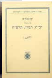
THE REBBE DISTRIBUTES THE KUNTRES ON THE NIGHT OF 9 TAMMUZ.

On the final Shabbos of the month, Shabbos “Chazak,” Parshas Matos-Masei, the Rebbe spoke about the fact that when reaching the end of the Sefer , we proclaim “Chazak” three times. This alludes to the descent we experience during the three weeks of mourning and how, ultimately, we emerge even higher and stronger than before.