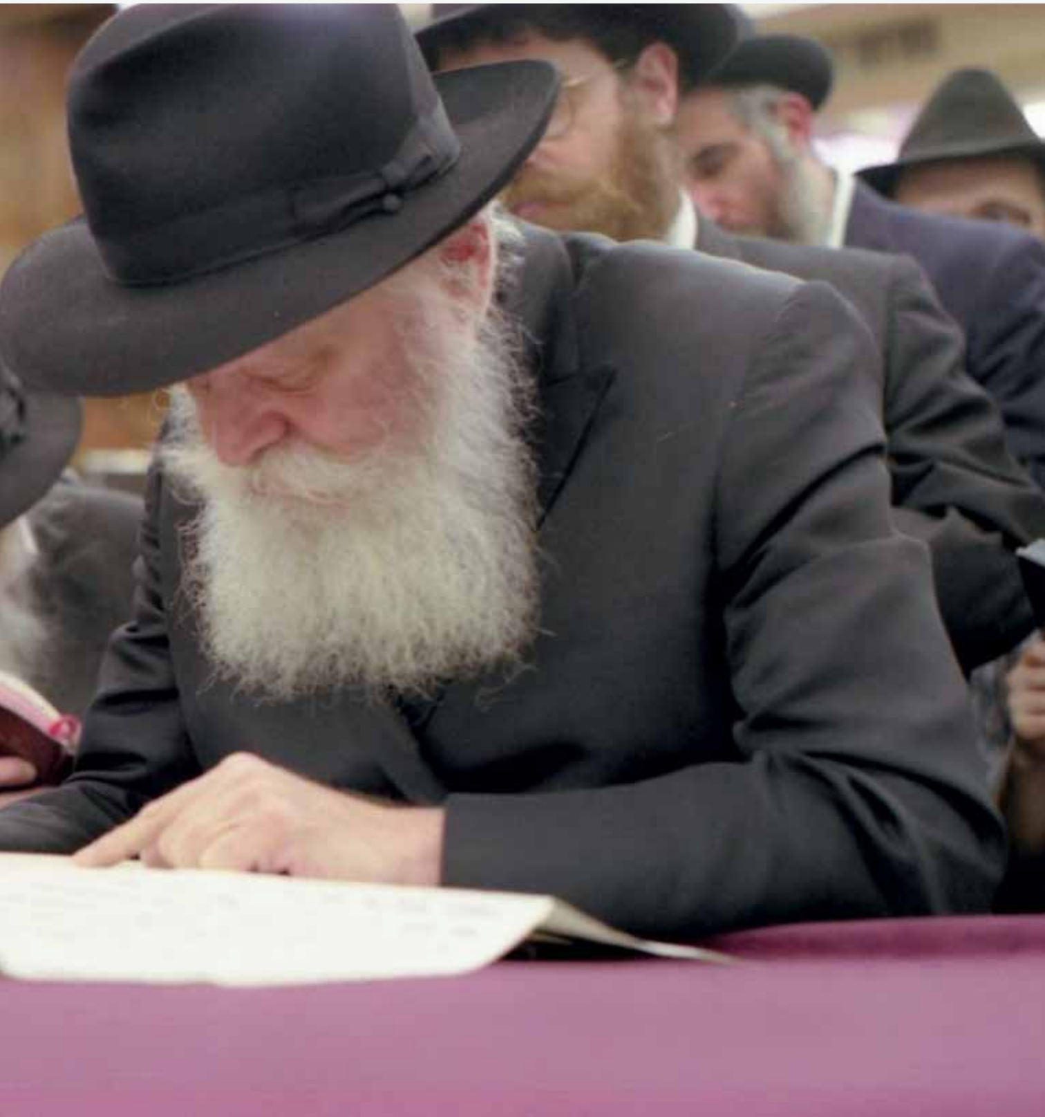
THE REBBE RECITES THE HAFTORAH ON SHIVA ASAR B'TAMMUZ, 5750.