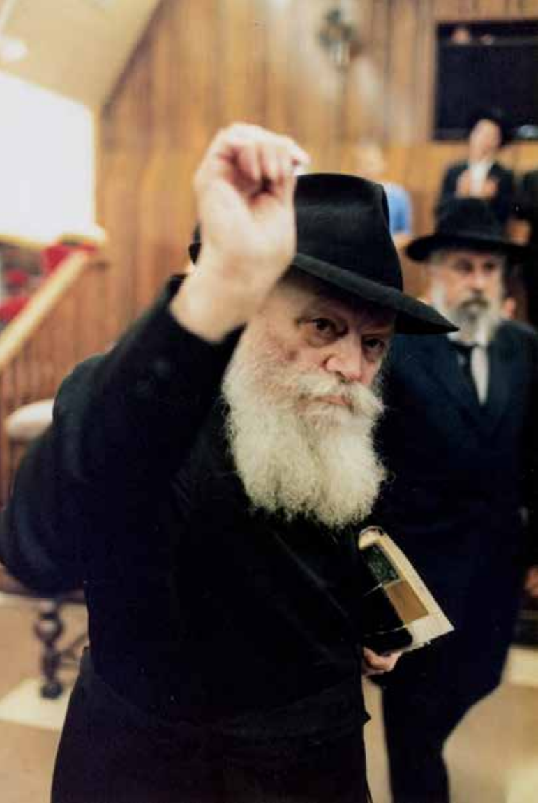
THE REBBE EXITS THE SHUL ON 12 TAMMUZ WITH THE NEW KUNTRES TUCKED INTO HIS SIDDIR.

dollars distribution, the Rebbe left for the mikvah holding the newly printed kuntres in hand.