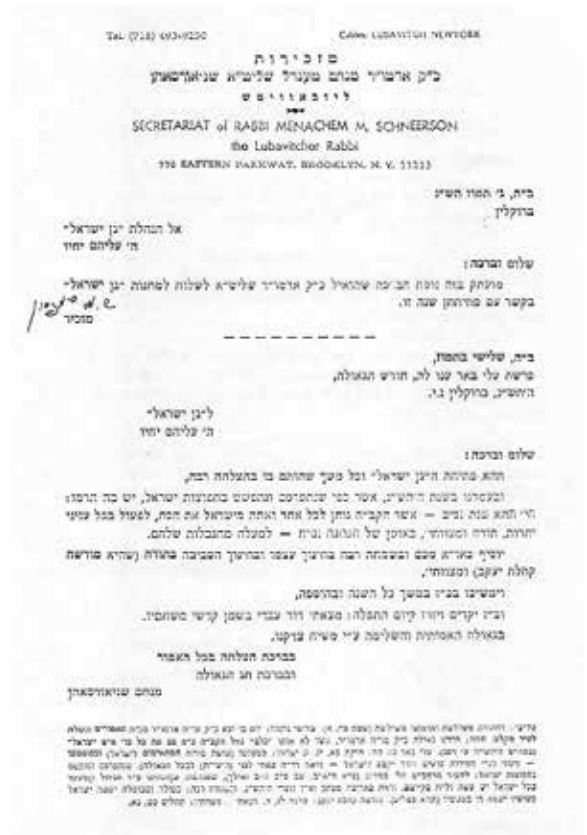
THE REBBE'S MESSAGE TO CHILDREN ATTENDING GAN YISROEL CAMPS, 3 TAMMUZ 5750.

The distribution lasted about an hour and a half, throughout which the Rebbe was in excellent spirits, smiling at many who passed—especially women and children. At the end, the Rebbe placed three copies into his siddur and began exiting the shul. At the exit, a few