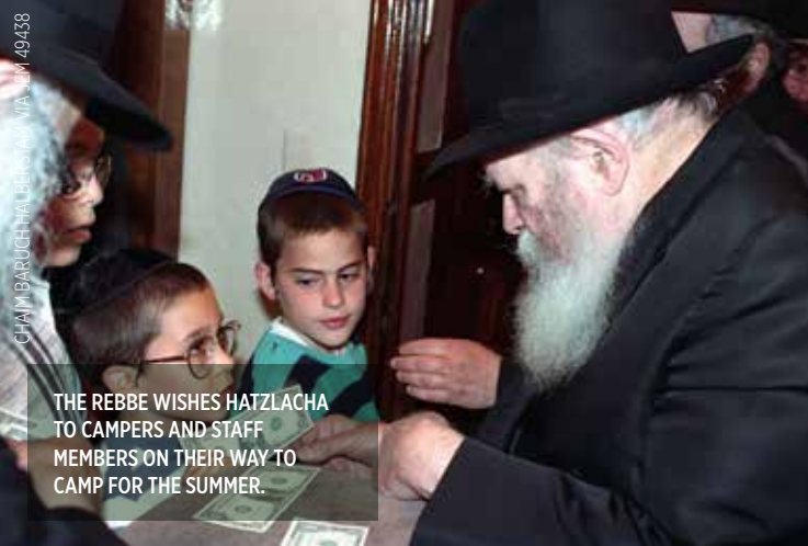
THE REBBE WISHES HATZLACHA TO CAMPERS AND STAFF MEMBERS ON THEIR WAY TO CAMP FOR THE SUMMER.