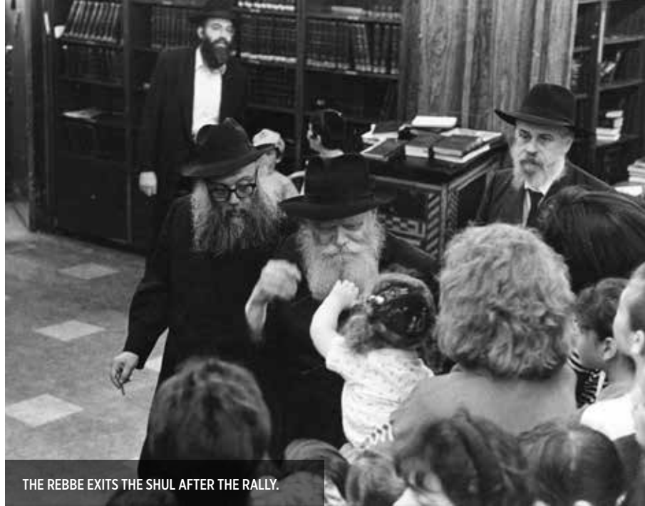
THE REBBE EXITS THE SHUL AFTER THE RALLY.

Rebbe's nesius that he visited the Ohel on this day.)