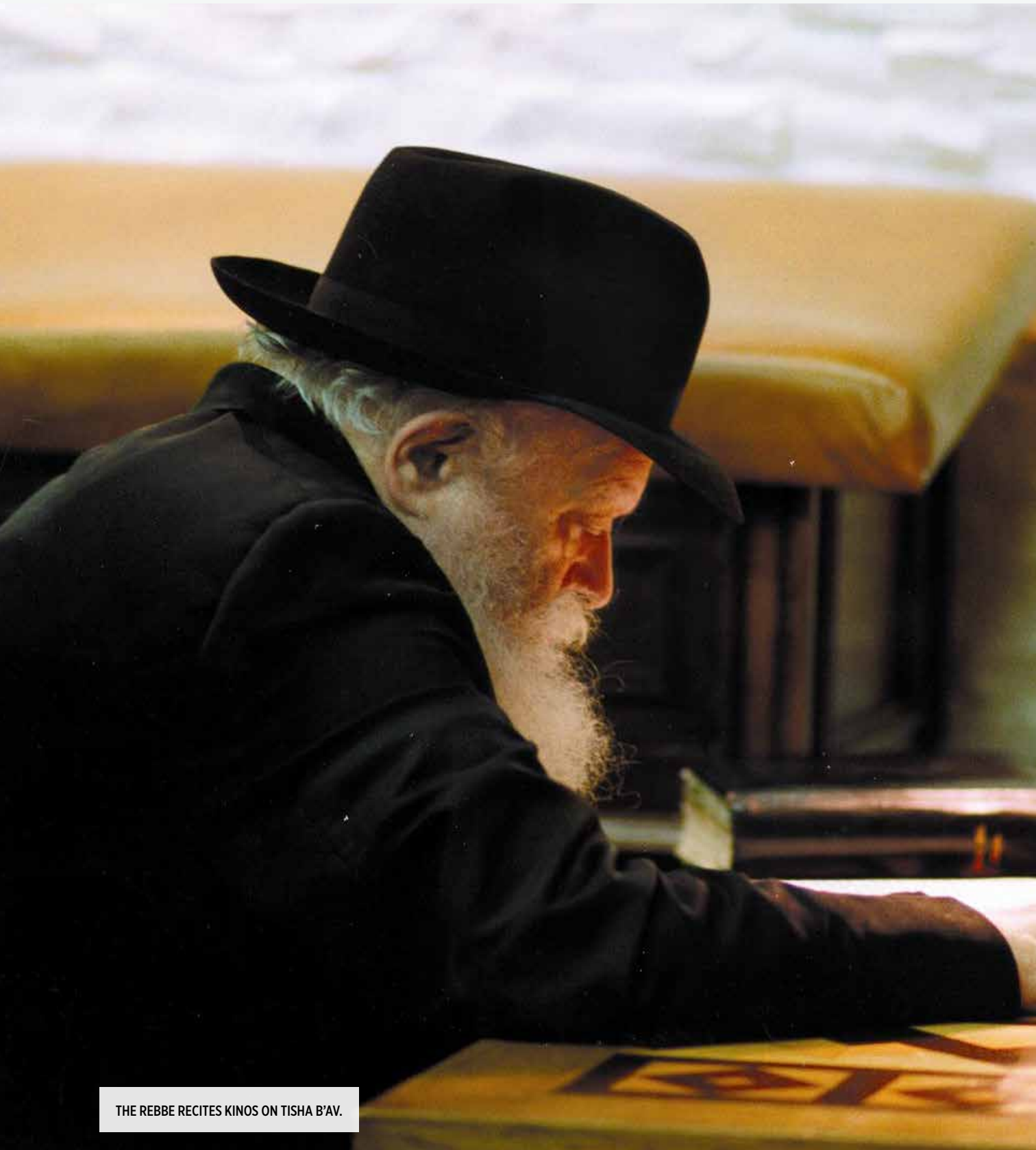
THE REBBE RECITES KINOS ON TISHA B'AV.