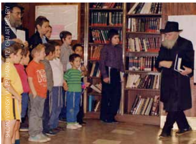
THE REBBE ENTERS THE SHUL ON TISHA B'AV.

At 12:10, the Rebbe entered the car to leave for the Ohel. Huge crowds had gathered on Eastern Parkway in anticipation of the levaya , and the Rebbe waved to many people from the window of the car.