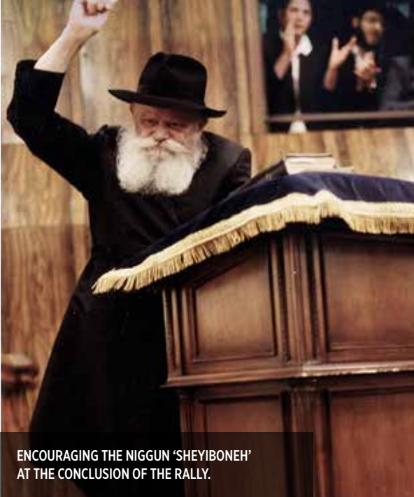
ENCOURAGING THE NIGGUN 'SHEYIBONEH' AT THE CONCLUSION OF THE RALLY.