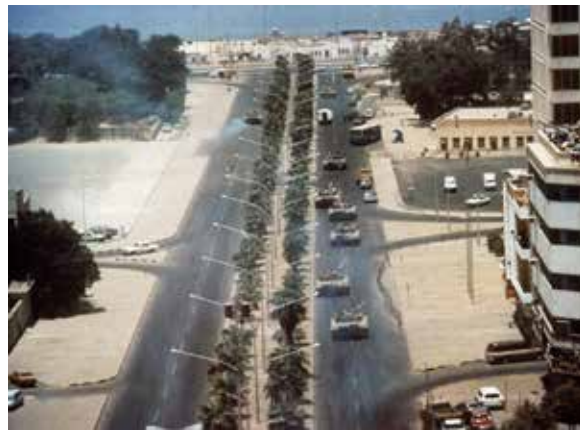
IRAQI TANKS ENTERING KUWAIT IN THE MONTH OF AV 5750.