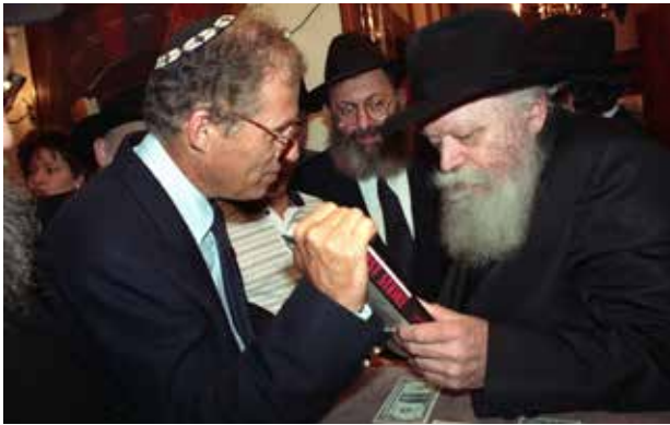
CHAIM BARUCH HALBERSTAM VIA JEM 51909