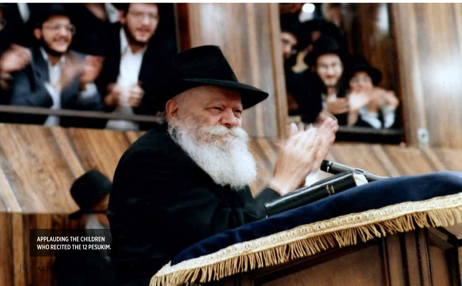
APPLAUDING THE CHILDREN WHO RECITED THE 12 PESUKIM.

On the first day of the month, Rosh Chodesh Av, and on the last day of the month—the first day of Rosh Chodesh Elul—the Rebbe went to the Ohel. (The Rebbe's visit to the Ohel on Rosh Chodesh was unprecedented. No one could remember another time throughout the