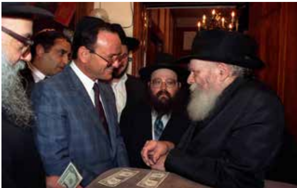
CHAIM BARUCH HALBERSTAM VIA JEM 52985