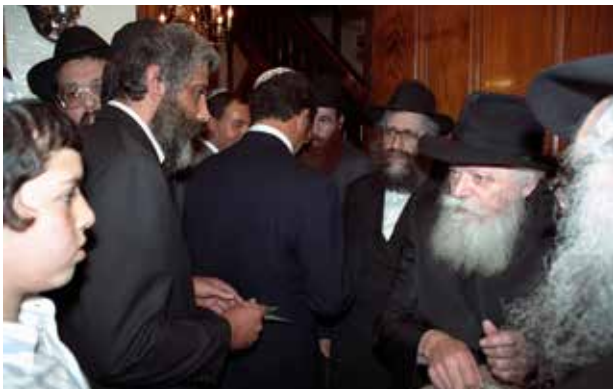
CHAIM BARUCH HALBERSTAM VIA JEM 51990