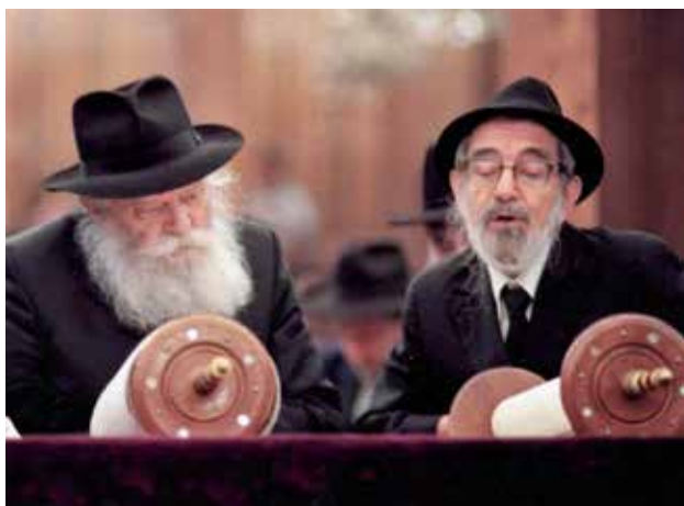
RECEIVING AN ALIYA DURING SHACHARIS.