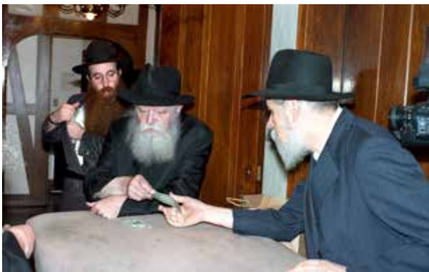
CHAIM BARUCH HALBERSTAM VIA JEM 52455