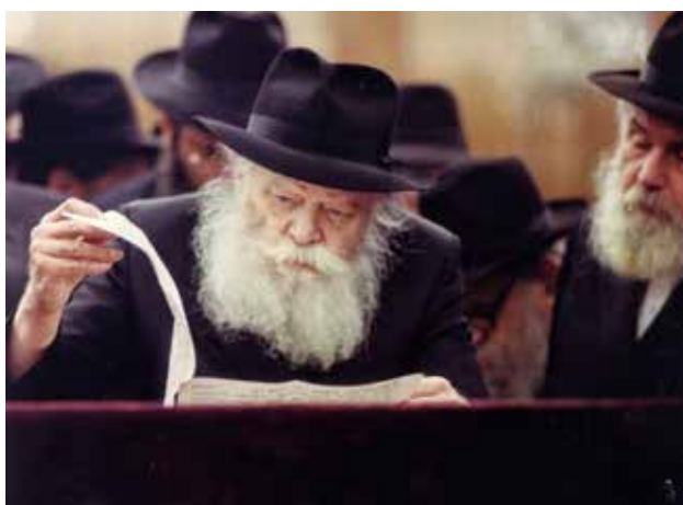
RECITING THE HAFTORAH DURING SHACHARIS.