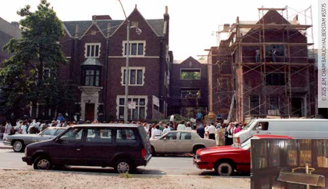
© 2025 JEM, CHAIM BA RUCH HALBERSTAM #53775