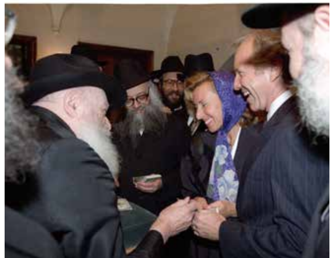
SENATOR JOSEPH LIEBERMAN AND HIS WIFE HADASSAH IN CONVERSATION WITH THE REBBE, 26 ELUL.