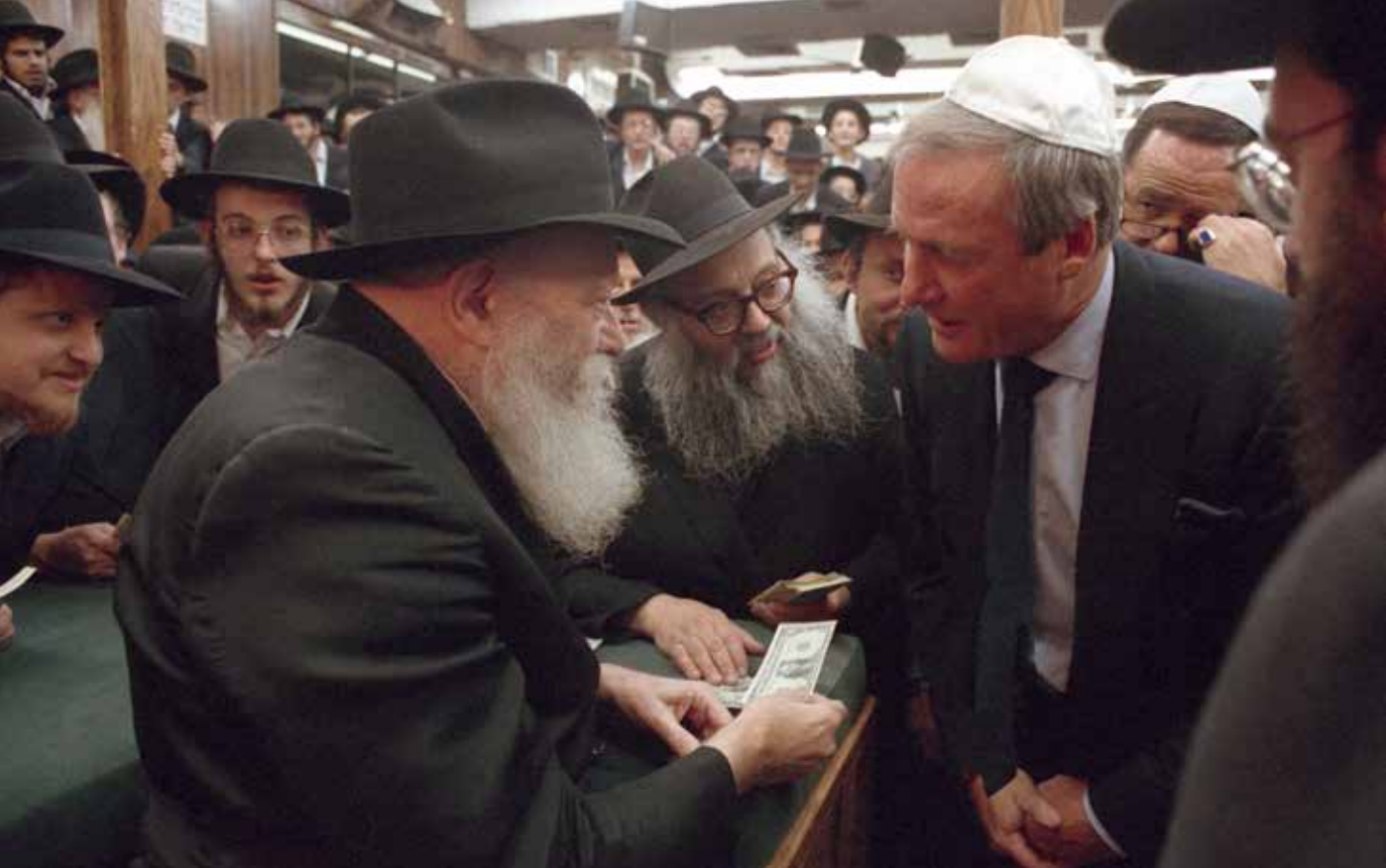
© 2025 JEM LEVI FREDIN #166382