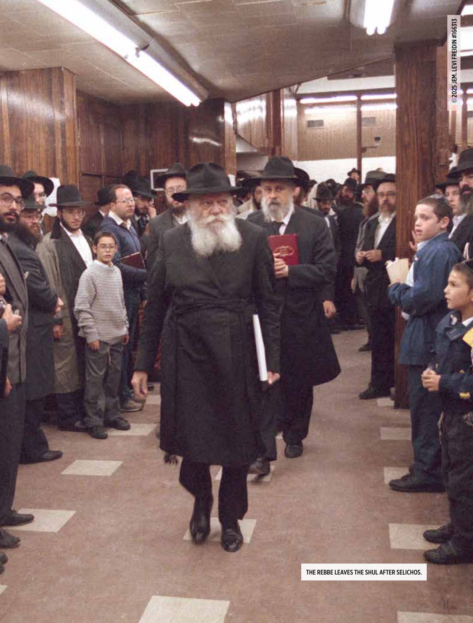
THE REBBE LEAVES THE SHUL AFTER SELICHOS.