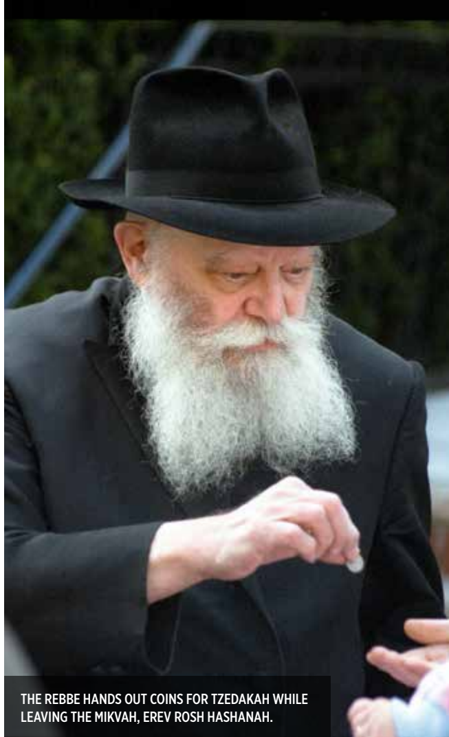
THE REBBE HANDS OUT COINS FOR TZEDAKAH WHILE LEAVING THE MIKVAH, EREV ROSH HASHANAH.

An individual told the Rebbe that he heard that the Rebbe asked everyone to speak about the words of the Yalkut Shimoni (about the imminent coming of Moshiach), and the Rebbe agreed, adding, “Don’t be afraid that [it might be perceived as] we’re mixing into politics...”