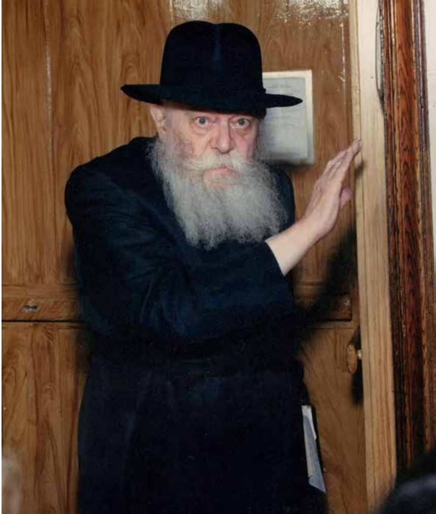
THE REBBE EXITS THE ELEVATOR ON THE WAY TO HIS ROOM AFTER THE CONCLUSION OF THE CHILDREN'S RALLY, 7 ELUL.