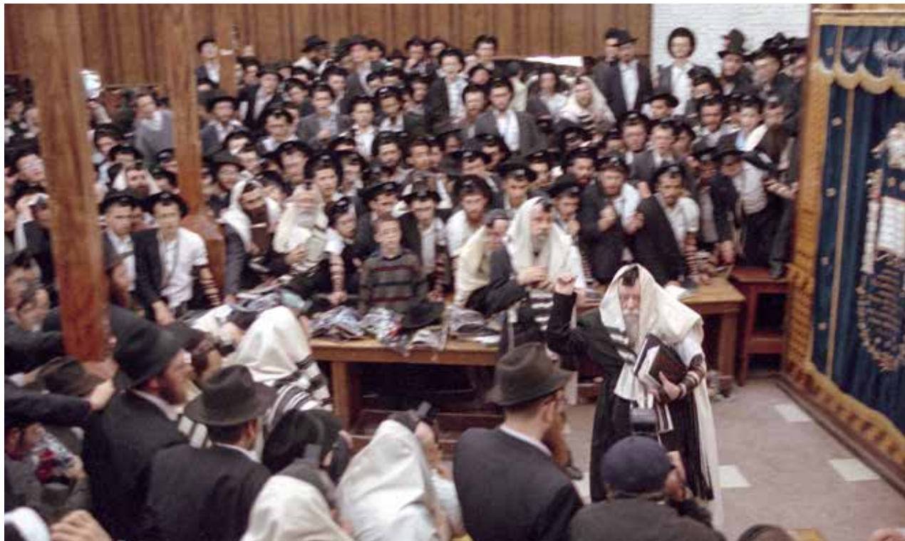
(29 ELUL 5750)