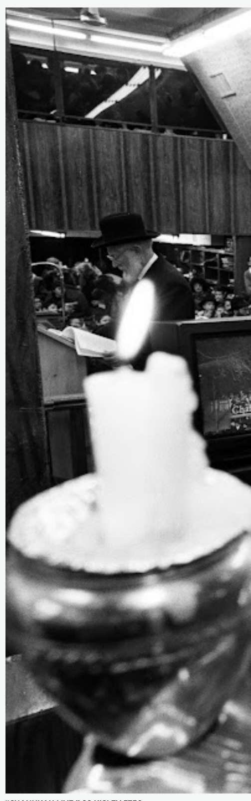
"CHANUKAH LIVE," 28 KISLEV 5750

COMPILED BY: RABBI YANKY BELL WRITTEN BY: RABBI MENDEL JACOBS