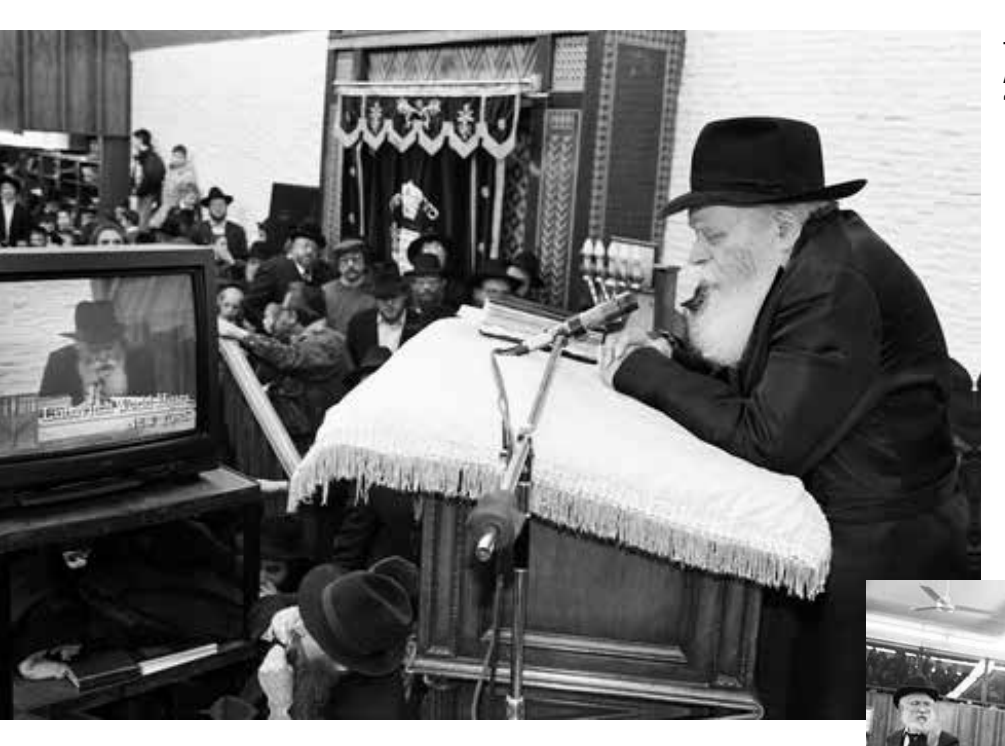
THE REBBE DELIVERS A SICHA AT "CHANUKAH LIVE."