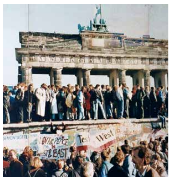
FALL OF THE BERLIN WALL, CHESHVAN 5750, MARKING THE BEGINNING OF THE COLLAPSE OF THE SOVIET UNION.

It was 18 Kisley, the day before the Yom Tov of Yud-Tes Kisley, and the Rebbe dedicated much of his talk to