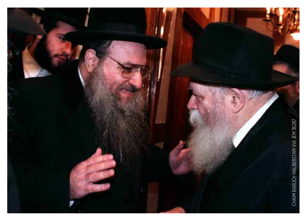
A RAV FROM BORO PARK THANKS THE REBBE FOR THE BOCHURIM WHO CAME TO SPEAK AT HIS SHUL.