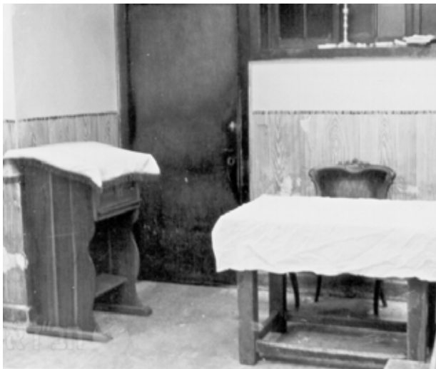
THE REBBE'S SHABBOS AND YOM TOV DAVENING PLACE (PHOTO FROM CIRCA 5730).