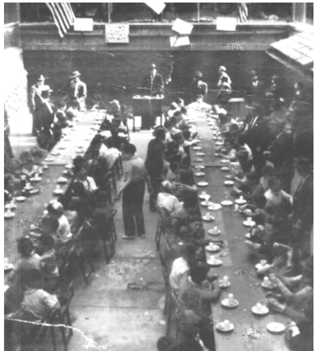
CHILDREN GATHER FOR AN EVENT IN THE COURTYARD OF 770 IN THE 5710S.

piercing, but full of warmth, and his face had a special glow.