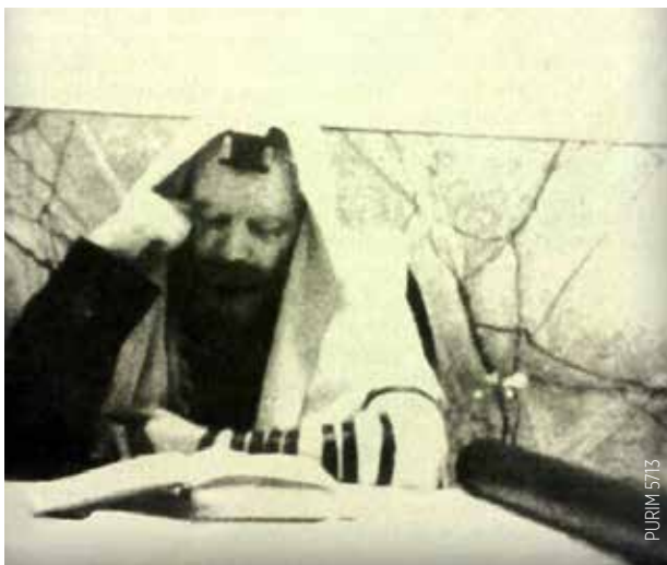
THE REBBE DAVENING SHACHARIS AT HIS SHABBOS PLACE.