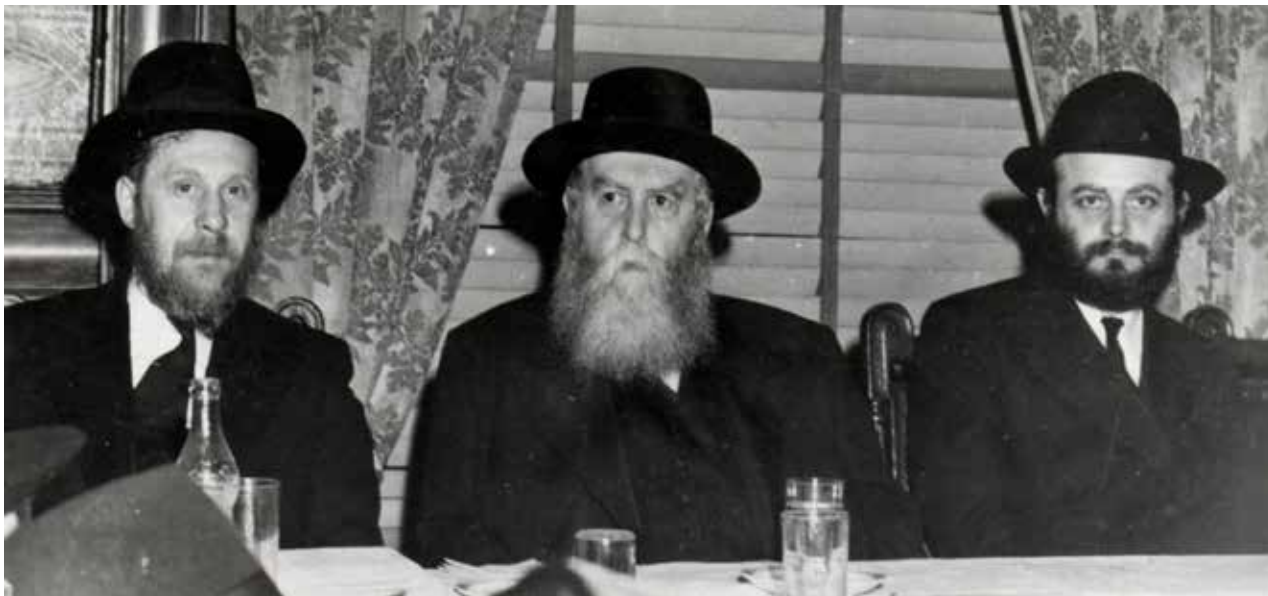
THE FRIERDIKER REBBE FLANKED BY THE REBBE AND RASHAG, 5703.

later. Once, while discussing one of the issues regarding the trial of the seforim , the Rebbe remarked to me: “ Bist doch ah chossid fun’m shver —You’re a Chossid of my father-in-law.”