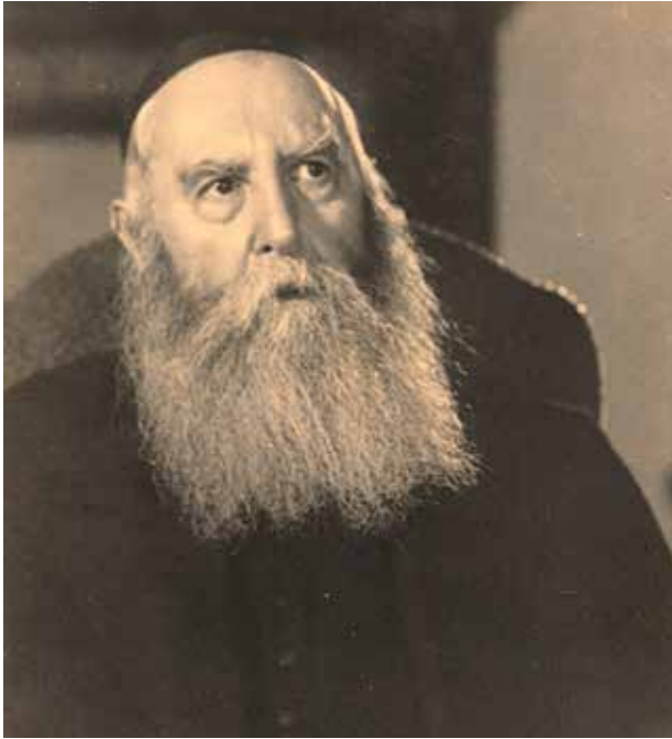
THE FRIEDIKER REBBE IN HIS YECHIDUS ROOM IN MID-5709.

Shabbos until the end of Mizmor Shir Lyom Hashabbos , and recited that kaddish as well. With that, the davening concluded, and we left.