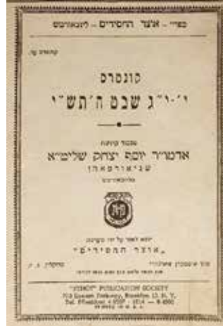
THE KUNTRES WITH THE FRIEDIKER REBBE'S MAAMARIM, PUBLISHED FOR YUD SHEVAT 5710.

I remember eating seudas Shabbos that Friday night with a few close chaveirim ; we sat in the kitchen with two other