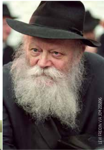
THE REBBE DISTRIBUTING DOLLARS ON THE NIGHT OF YUD SHEVAT 5750.