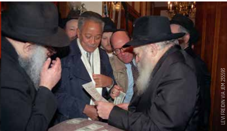
LEVI FREIDIN VIA JEM 235593