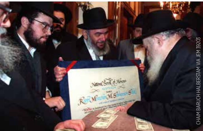
CHAIM BARUCH HALBERSTAM VIA JEW 39203