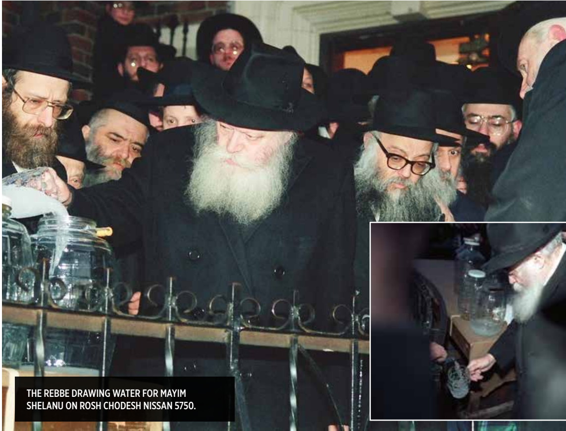
THE REBBE DRAWING WATER FOR MAYIM SHELANU ON ROSH CHODESH NISSAN 5750.

Seven cases of matzos arrived near the Rebbe's room. First, the Rebbe separated "challah," breaking off some matzah from the cases. Then the Rebbe gave packets of matzah to each of the representatives, including those traveling to Australia, London, Manchester, Brazil, Nepal,