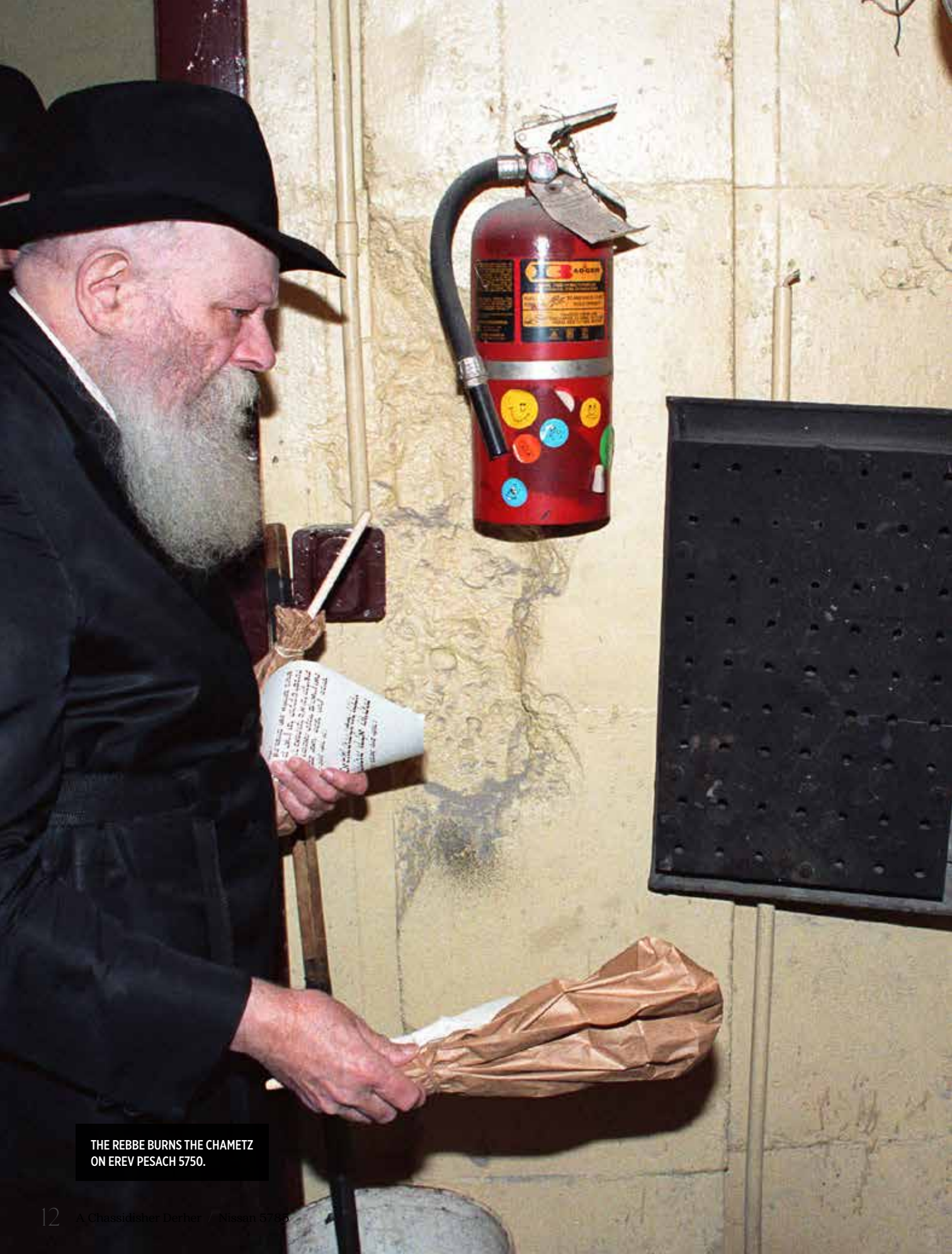
THE REBBE BURNS THE CHAMETZ ON EREV PESACH 5750.