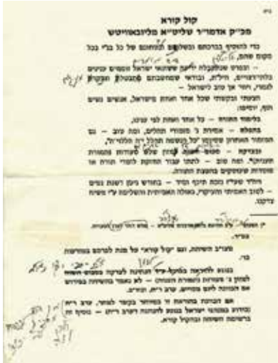
THE REBBE'S EDITS ON THE "KOL KOREH" THAT WAS RELEASED AFTER THE SICHA.