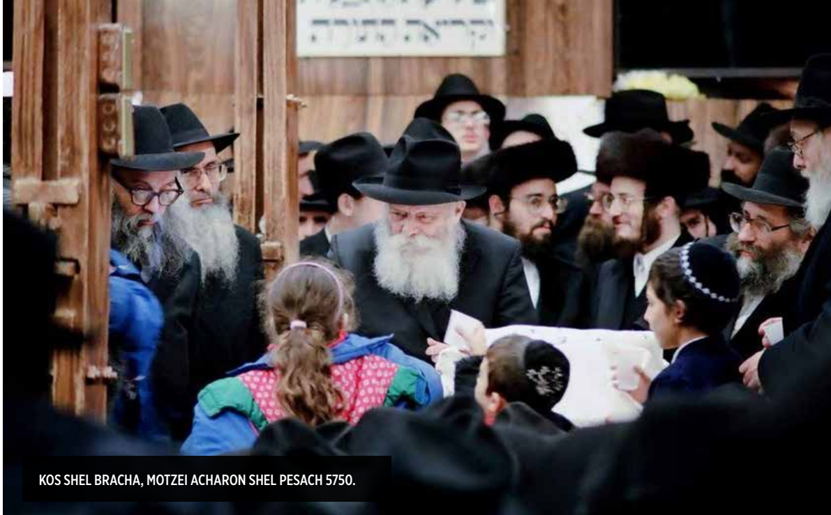
KOS SHEL BRACHA, MOTZEI ACHARON SHEL PESACH 5750.