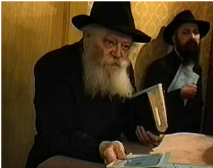
THE REBBE DISTRIBUTING THE KUNTRES ON 11 NISSAN 5750.