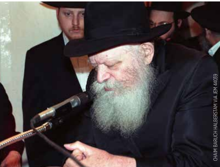
CHAIM BARUCH HALBERSTAM