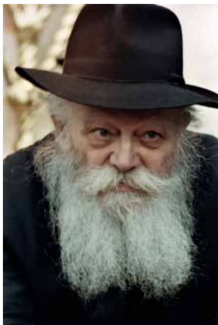
ROSH CHODESH NISSAN 5750.

The Rebbe continued on this subject for more than an hour, speaking with fire and passion, even lifting himself slightly from his chair every so often. Upon the