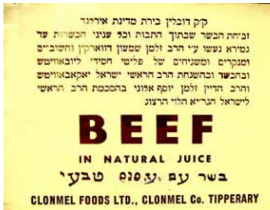
LABEL OF THE KOSHER TINNED MEAT SENT FROM IRELAND.

“... you relate the details concerning your journey to Dublin and ask my opinion whether you should travel there now, since you are not capable of making an independent decision, because you are employed by Yeshivas Tomchei Temimim in Brunoy, [France].