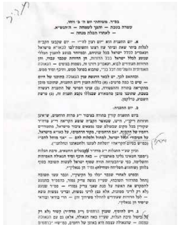
THE REBBE'S EDITS ON THE SICHA FROM 10 TEVES. ON THE TOP LEFT, THE REBBE ADDED 'MAHIR', INDICATING THAT IT BE PUBLISHED IMMEDIATELY. THE REBBE REPEATED THIS PRACTICE AS HE SPOKE ON THE SUBJECT AGAIN THROUGHOUT THE FOLLOWING WEEKS, ADDING 'MAHIR' TO EACH SICHA.