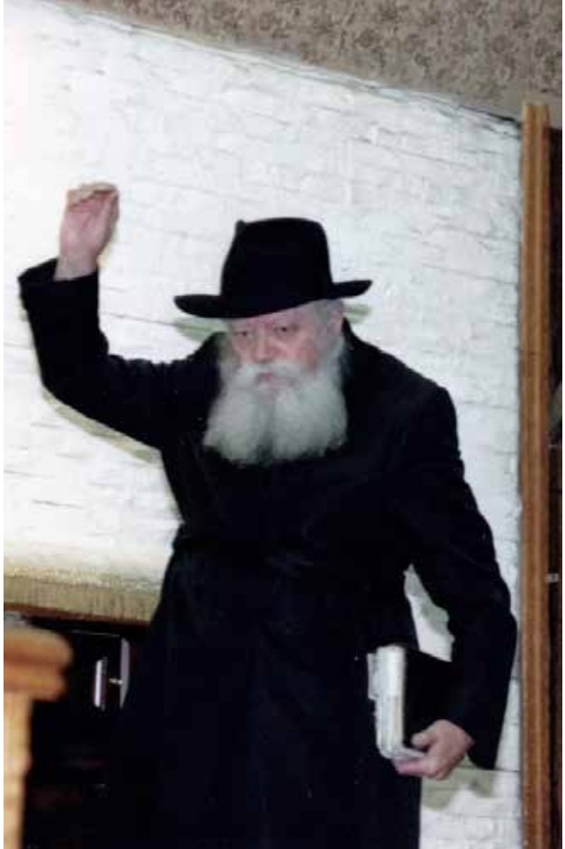
THE REBBE ENCOURAGES THE NIGGUN ‘UTZU EITZA’, 10 TEVES.

After Tachanun was recited, the Rebbe turned his siddur to the long Avinu Malkeinu and then turned towards the