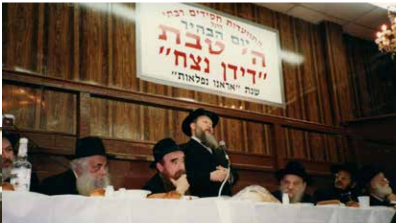
CHASSIDIM FARBRENG AT 770 ON MOTZEI SHABBOS, 5 TEVES.

At the end of the farbrengen, the Rebbe distributed bottles of mashke for events during the upcoming week, beginning with tonight’s Hei Teves farbrengen by the members of Agudas Chassidei Chabad. The Rebbe concluded the distribution by singing his father’s niggun , as usual, and then he began singing “ Al nisecha... ,” encouraging the crowd to sing faster and louder.