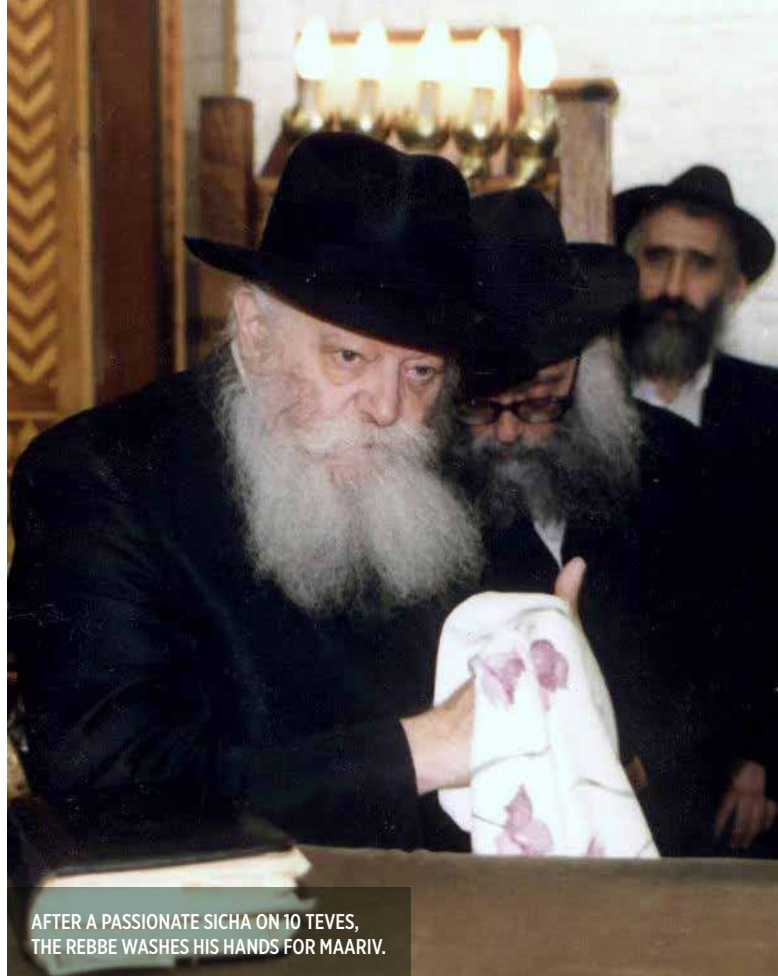
AFTER A PASSIONATE SICHA ON 10 TEVES, THE REBBE WASHES HIS HANDS FOR MAARIV.

At the conclusion of this sicha , the crowd sang Napoleon’s March, and the Rebbe’s encouragement was something other-worldly. The Rebbe waved both hands in circular motions again and again, bringing the singing to an amazing crescendo. It almost seemed as if the walls of the shul were