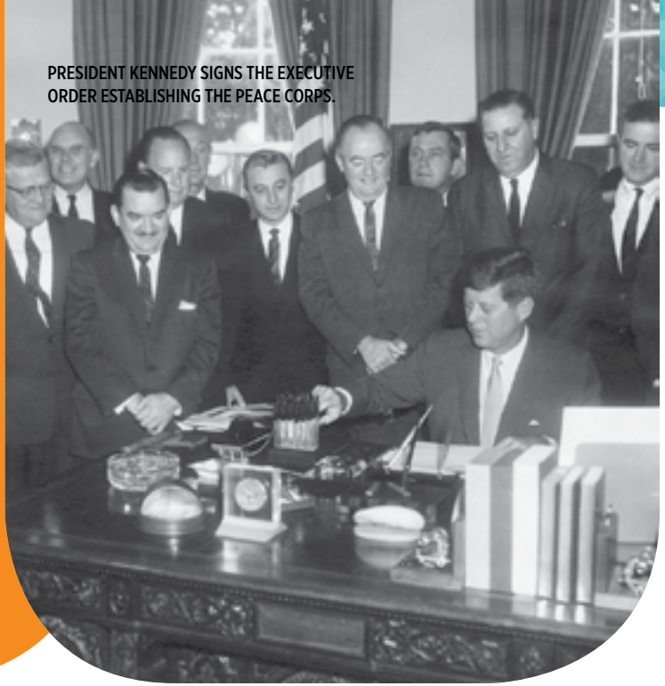
PRESIDENT KENNEDY SIGNS THE EXECUTIVE ORDER ESTABLISHING THE PEACE CORPS.

On March 1, 1961 (13 Adar 5721) President John F. Kennedy held a press conference announcing the signing of Executive Order 10924, establishing the Peace Corps. The following is a transcript of his announcement: