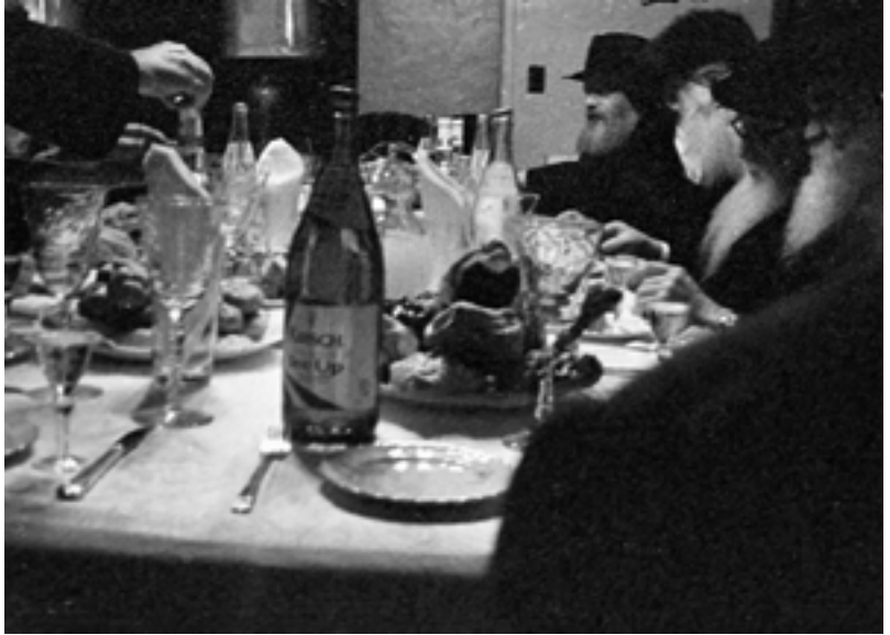
5729, CB HALBERSTAM via JEM 306766

3. Until 5732, the Rebbe would first go upstairs to the Friediker Rebbe's apartment for the breakfast seudah , and only afterwards go outside for kiddush levanah .