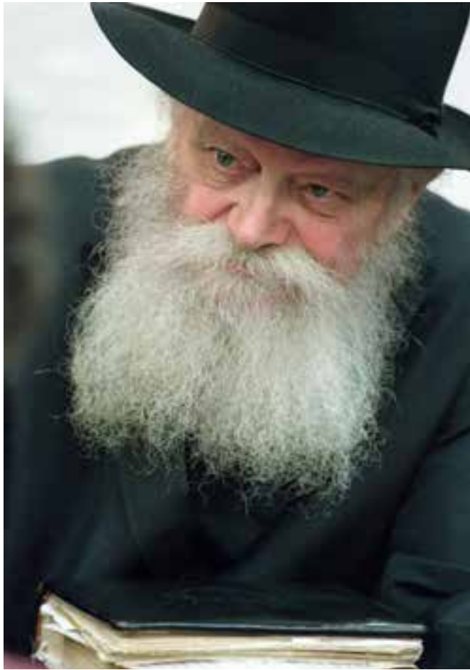
19 KISLEV 5751, YOSSI MELAMED VIA JEM 113124