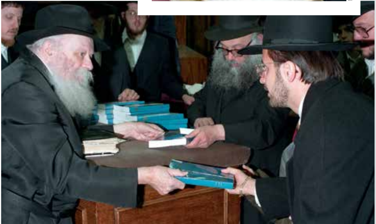
19 KISLEV 5751, YOSSI MELAMED VIA JEM 118037