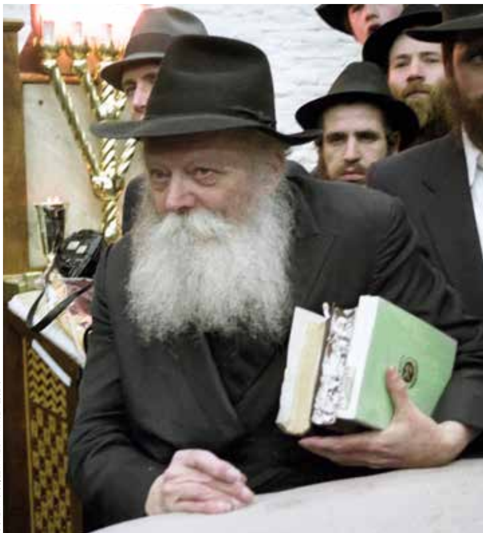
10 SHEVAT 5750, LEVI FREIDIN VIA JEM 238243