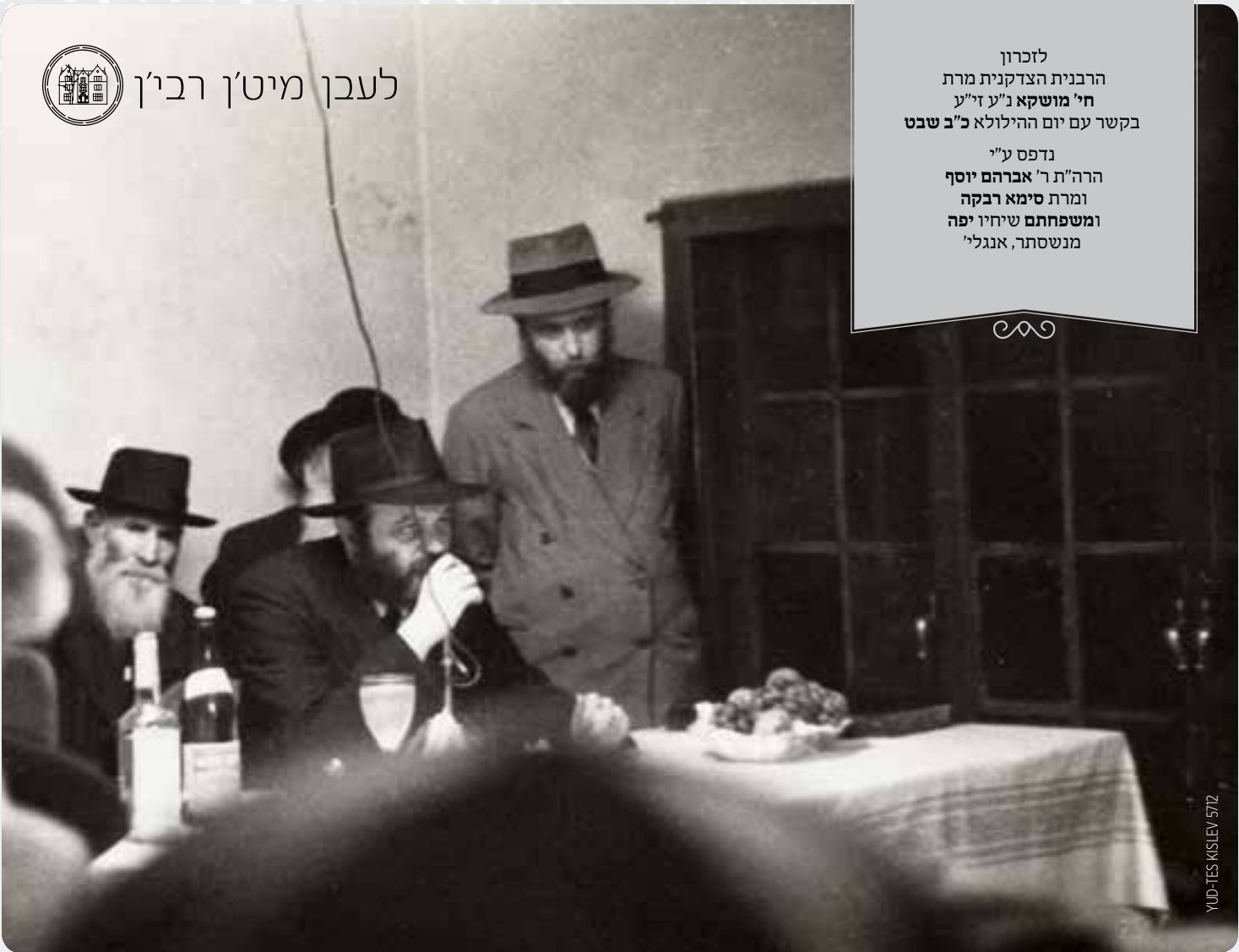
YUD-TESS KISLEV 5712