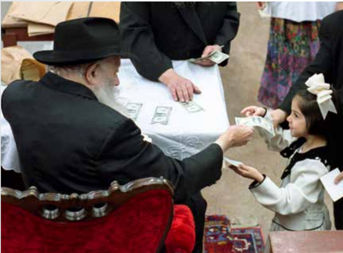
30 TISHREI 5752, LEVI FREIDIN VIA JEM 163123

Initially these yechidusen were held as groups in the Rebbe's room, but with time they were moved downstairs in order to handle larger groups.