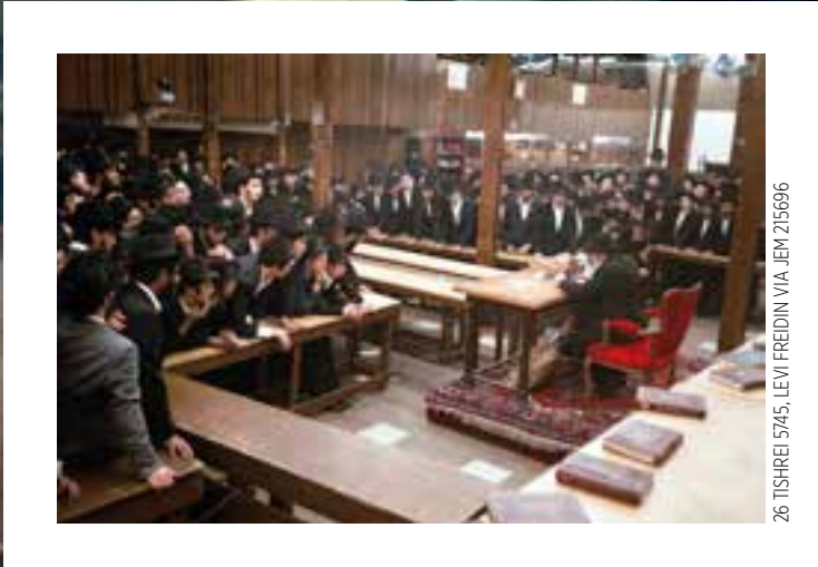
26 TISHREI 5745, LEVI FREDIN VIA JEM 215696