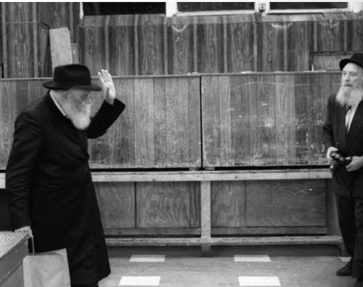
14 TAMMUZ 5751

As the last group left, the Rebbe placed the piles of panim in paper bags, and personally carried the large bag to his room.