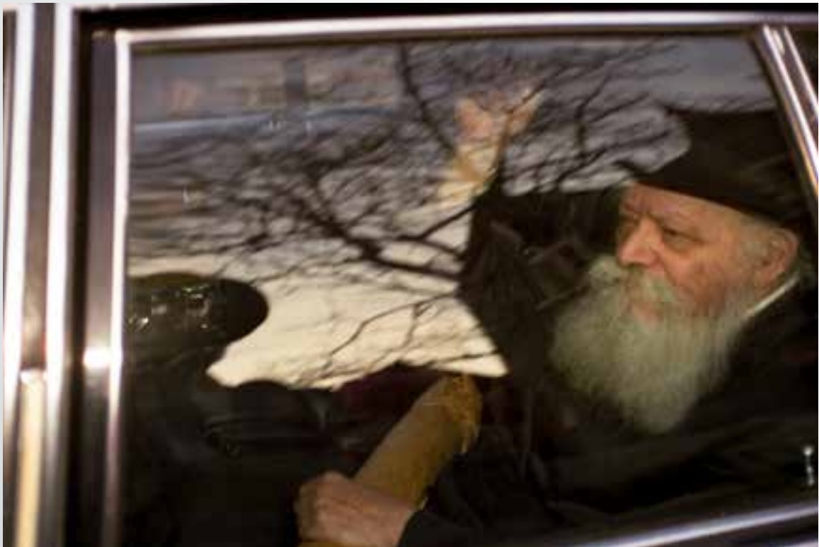
PURIM 5749, CH HALBERSTAM VIA JEM 24529