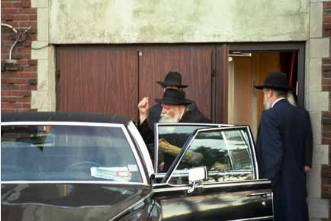
PURIM 5749, CH HALBERSTAM VIA JEM 24526