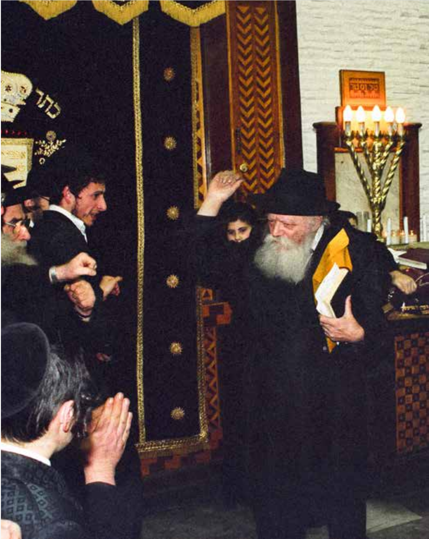
PURIM 5749, CH HALBERSTAM VIA JEM 24614