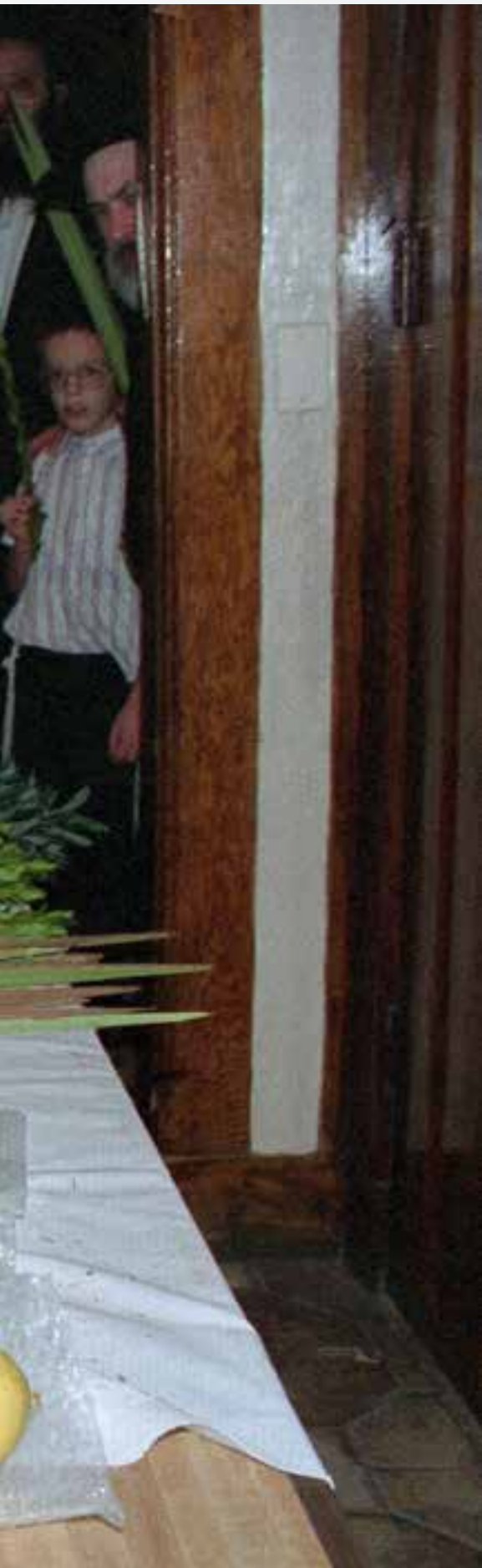
14 TISHREI 5751 174248