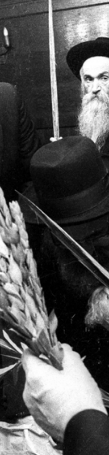
14 TISHREI 5737, LEVI FREIDIN VIA JEM 204627