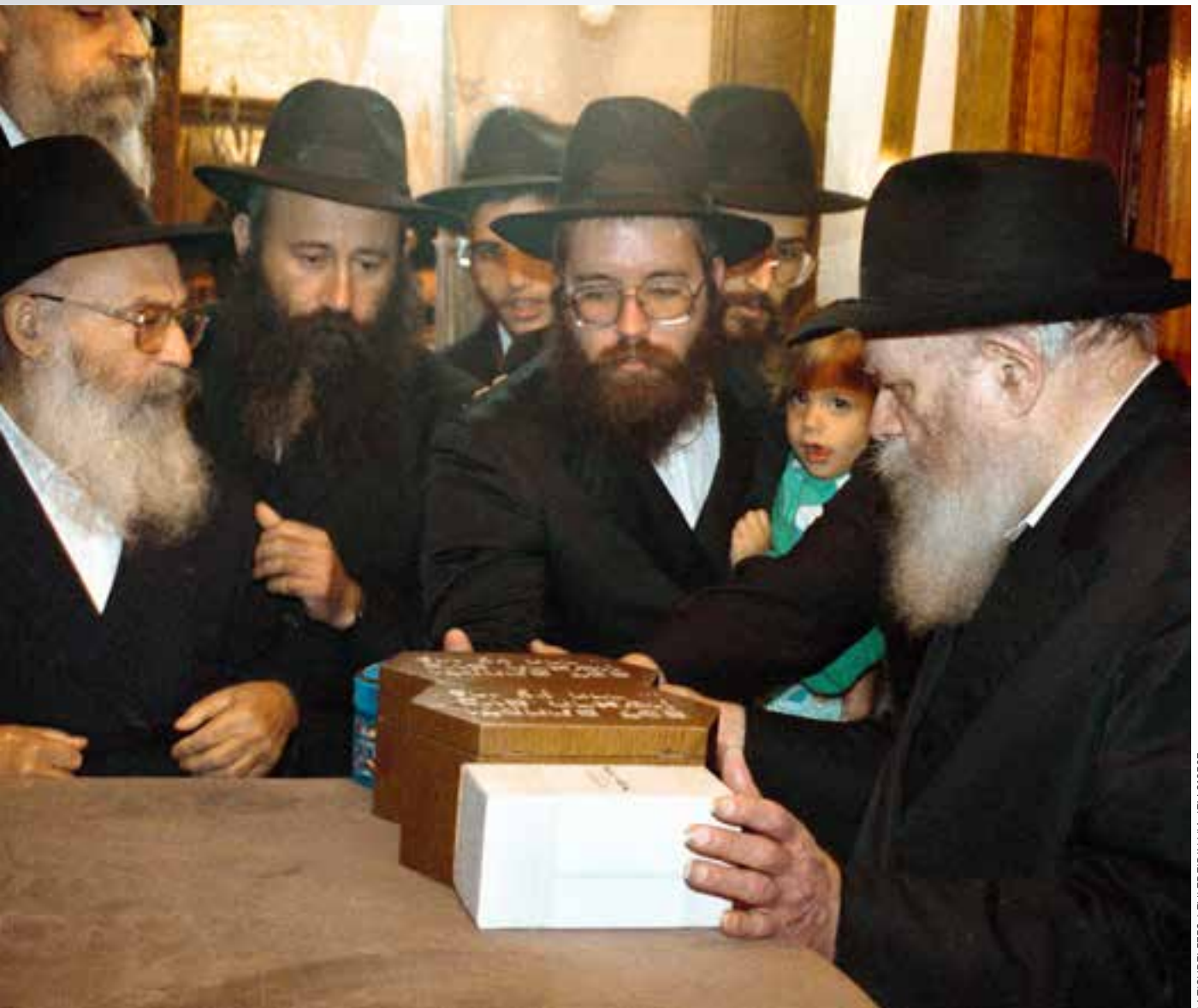
14 TISHREI 5752

Representatives from Eretz Yisroel would then bring esrogim to the Rebbe, and the Rebbe would give them a short brocha . (Although the Rebbe always said the brocha on an esrog from Calabria in accordance with minhag Chabad, later in the day the Rebbe did the mitzvah again with an esrog from Eretz Yisroel).