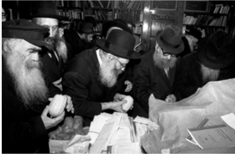
14 TISHREI 5738, LEVI FREIDIN VIA JEM 22530