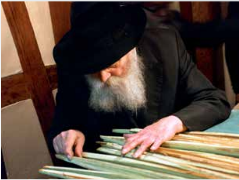
14 TISHREI 5752, CB HALBERSTAM VIA JEM 86297