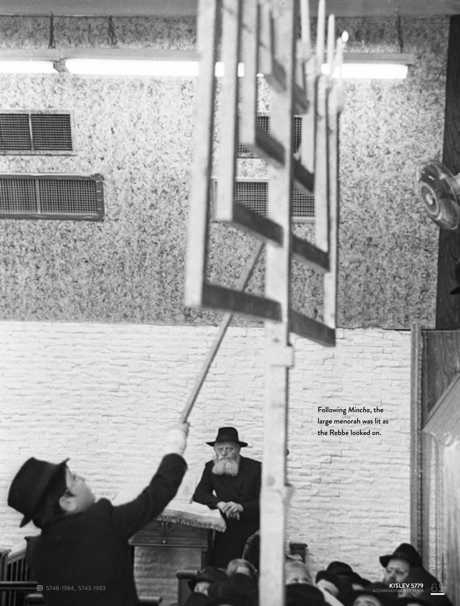
Following Mincha , the large menorah was lit as the Rebbe looked on.

1 TEVES 5742, YOSSI INELAMED VIA JEM 129967