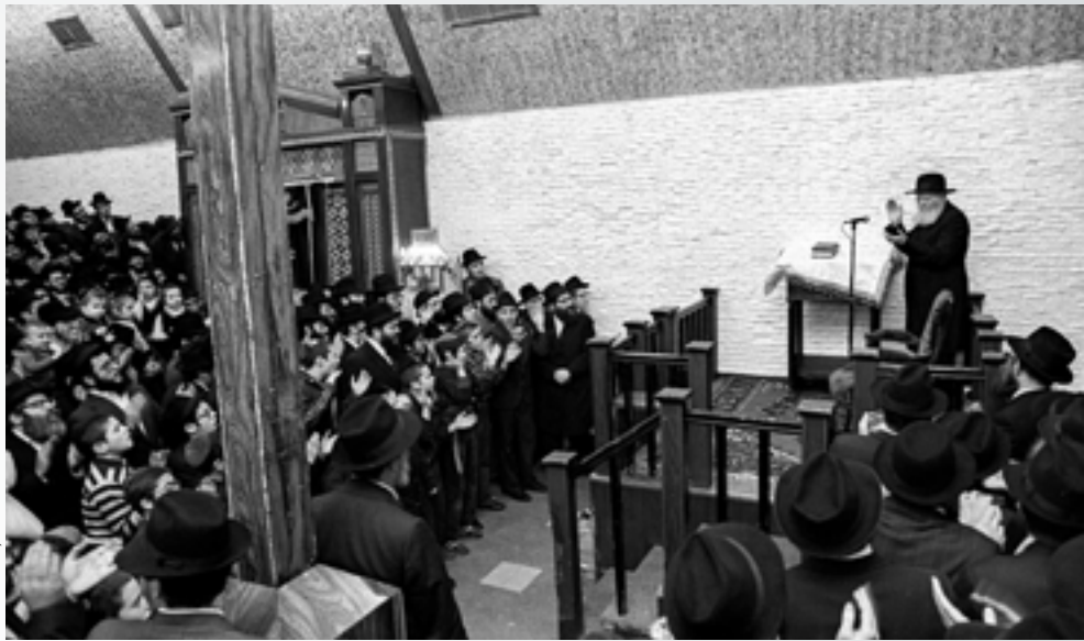
The Rebbe joins the “Chanukah Live” program, 5751.

1 TEVES 5742, YOSSI MELAMED VIA JEM 129997