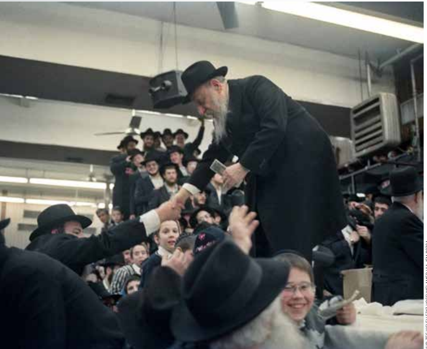
YUD-IES KISLEV 5747

After receiving a packet from the Rebbe, the tankistin would step down from the Rebbe's platform at the front of the shul and distribute the dollars. If they ran out of dollars, they would go to the mazkirus office, and one of the mazkirim would get more from the Rebbe.